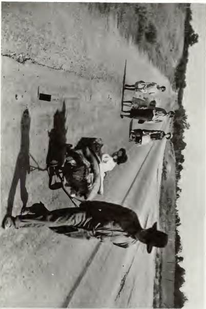
Family walking to Krebs, Oklahoma