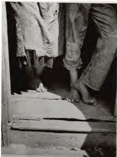
Library of Congress USF34-9694-E by Dorothea Lange People living in miserable poverty, Elm Grove, Okla.