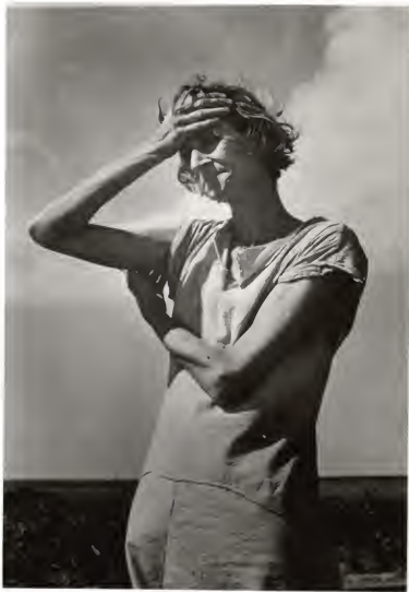
Library of Congress USF34-18294-C by Dorothea Lange "Woman of the High Plains" 9