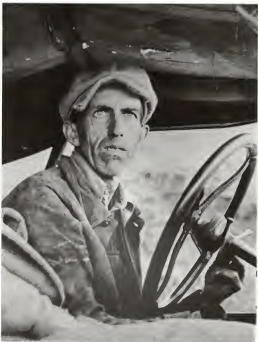
Library of Congress USF34-2470-E by Dorothea Lange "Ditched, stalled and stranded" (as cropped)