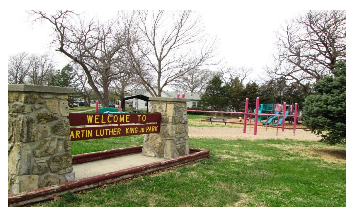
Figure 3. A photograph of Junction City's Martin Luther King Jr. Memorial Park. Source: Author Photograph, Junction City, Kansas, March 29, 2014.

and slightly dated, but brightly colored and inviting. Not only did the park have a playground, but also included a shelter, several benches, and a half-basketball court.