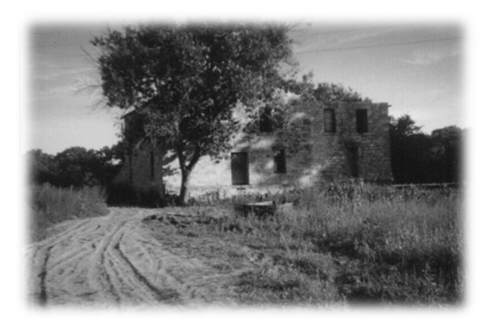
Figure 2. Photograph of the old Winkler Mill, ca 1958