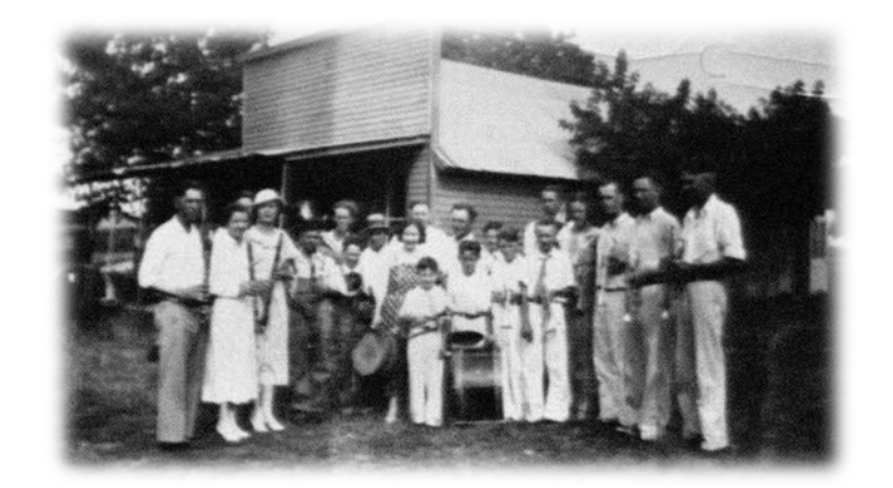
Figure 3. Photograph of Winkler Band, ca. 1936

band and honk horns instead of clapping.<sup>23</sup> The photography down below is a snap shot of the Winkler Band. "It was organized in 1933 to provide constructive interest and pastime during the drought years.<sup>24</sup>