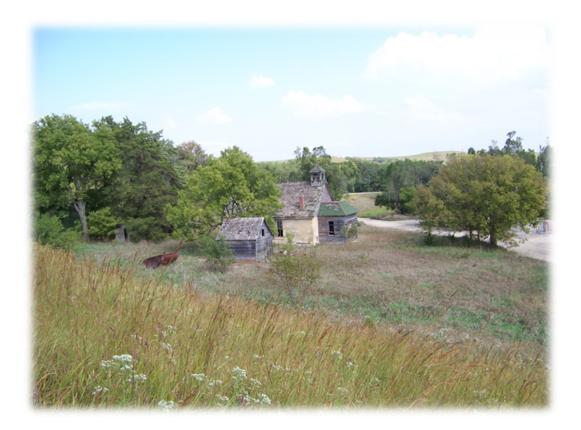
Figure 5. Photograph of Winkler School, 2010

time in which the town was a place for gathering, a place for learning, a place for shopping, a place for spiritual worship, and a place called home. "Just about the only thing left other than the old school building, are the memories of the beautiful valley and the little village at the base of the hills called Winkler."<sup>31</sup>