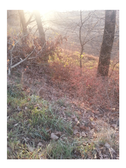
Figure 9: Photograph of remaining ox bow of present day Whiskey Lake. Whiskey Point, Kansas.

Traveling down Whiskey Lake Road parallel to the busy highway, you are met with a feeling of serenity and blissfulness, while just feet away cars are traveling up and down the highway. When you reach the fork in the road that connects Whiskey Lake Road to Raceway Road, you are reminded of how beautiful Kansas really is with its lush natural landscape, steep tree- infested hills, and stunning natural resources. When the town of Whiskey Point disappeared, this preserved a small tract of natural, enduring landscape.