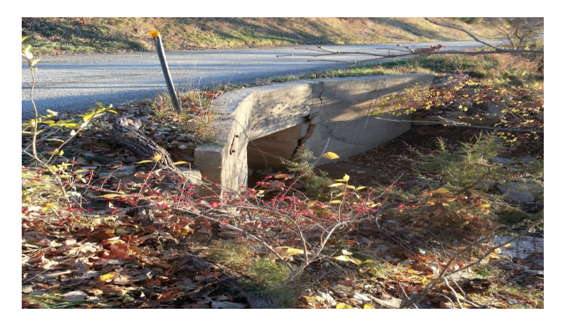
Figure 8: Photograph of remaining dike system of present day Whiskey Lake. Whiskey Point, Kansas.

Whiskey Point's small community disappeared in the late 1860s, but the ox- bow shaped lake still remained until it eventually dried up in the 1930s. In April of 1927, B.C. Carr tried to fight to have the lake become one of the finest lakes in Kansas. These efforts were lost due to the lake drying up in the 1930s Dust Bowl. The flood of 1951 brought the lake back to Whiskey Point. In July of 1984, the U.S. Army of Engineers devised a plan to put two dikes in north of the airfield the the lake would not intervene with their plan to expand Marshall Air Field on Fort Riley.