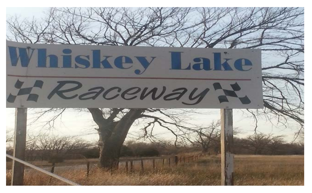
Figure 2: Photograph of Whiskey Lake Raceway as it appears today. November 28, 2012.

Driving down I-70 in Riley County, you would not imagine that part of Marshall Airfield was once a lake. As you take the exit going to Fort Riley, you might not have known that the road before you enter the post was once the thriving town of Whiskey Point, the "go to" spot for the cavalry soldiers on Fort Riley at the time. The town was founded in 1855 and did not survive much longer after that, roughly eight years. Today the once lavish lake is now nothing but farmland and a race track used mainly during the summer. The main reason the town died was that the Provost Marshall at the time decided to reprimand his soldiers and dump all the whiskey that the town had into the lake; thus, the life of Whiskey Point ended.