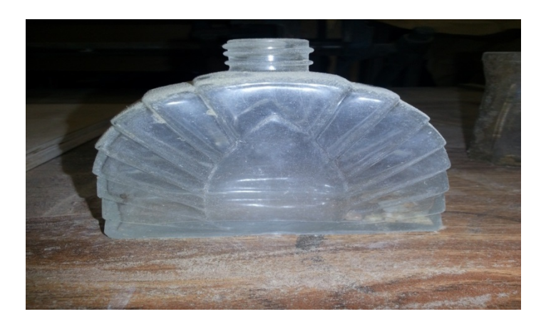
Figure 4: Photograph of a old perfume bottle found at Whiskey Point, Kansas. Courtesy of Joe Colbert. November 28, 2012. Photo by Author.