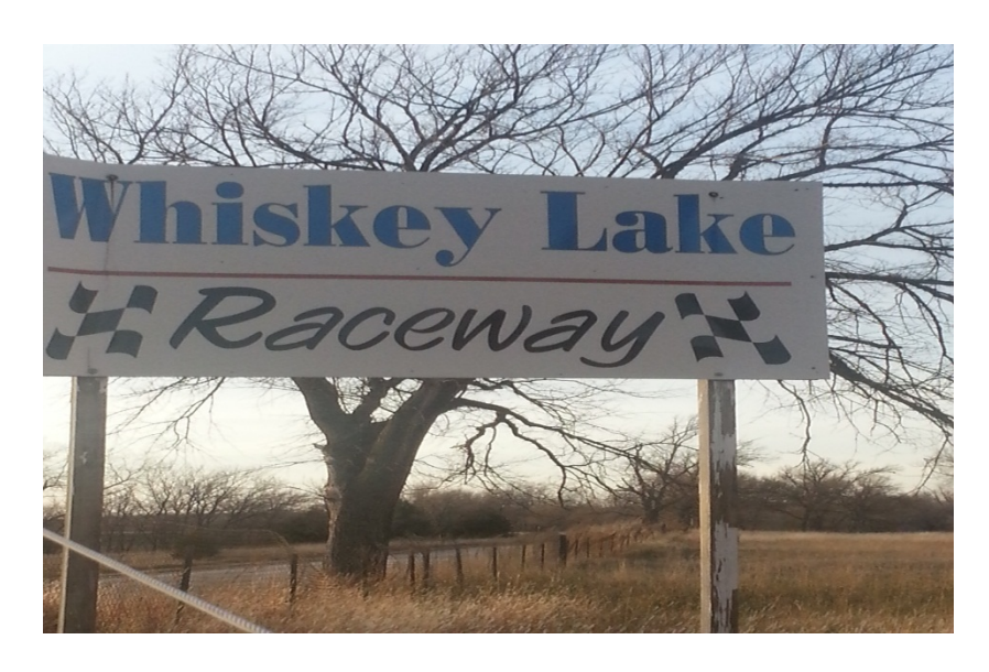
Figure 1: Photograph of Whiskey Point present day town site. Whiskey Lake Raceway is one of the only reminders of Whiskey Point in existence today.