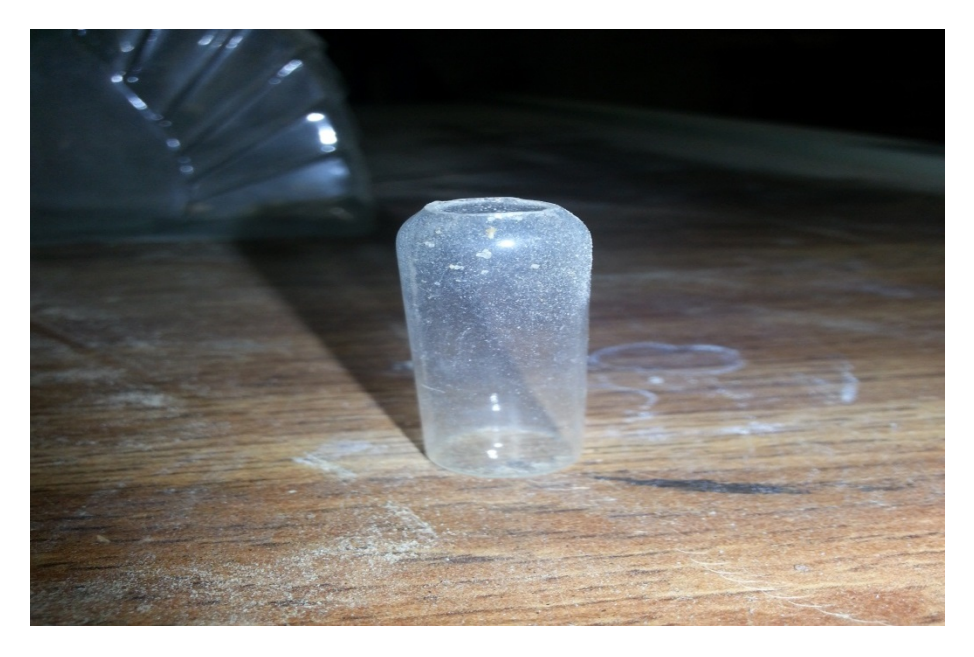
Figure 6: Photography of Opium Vial found at Whiskey Point, Kansas. Photographed November 28, 2012. Courtesy of Joe Colbert personal find. Photo taken by Author.