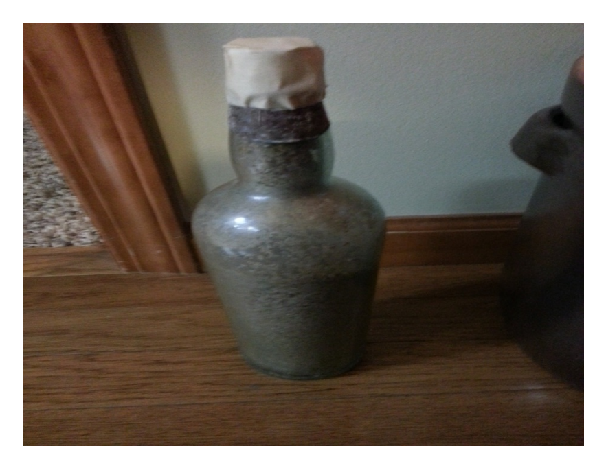
Figure 7: Photograph of an early Whiskey jug found at Whiskey Point, Kansas. Photographed November 28, 2012. Courtesy of Joe Colbert personal find. Photo taken by Author.