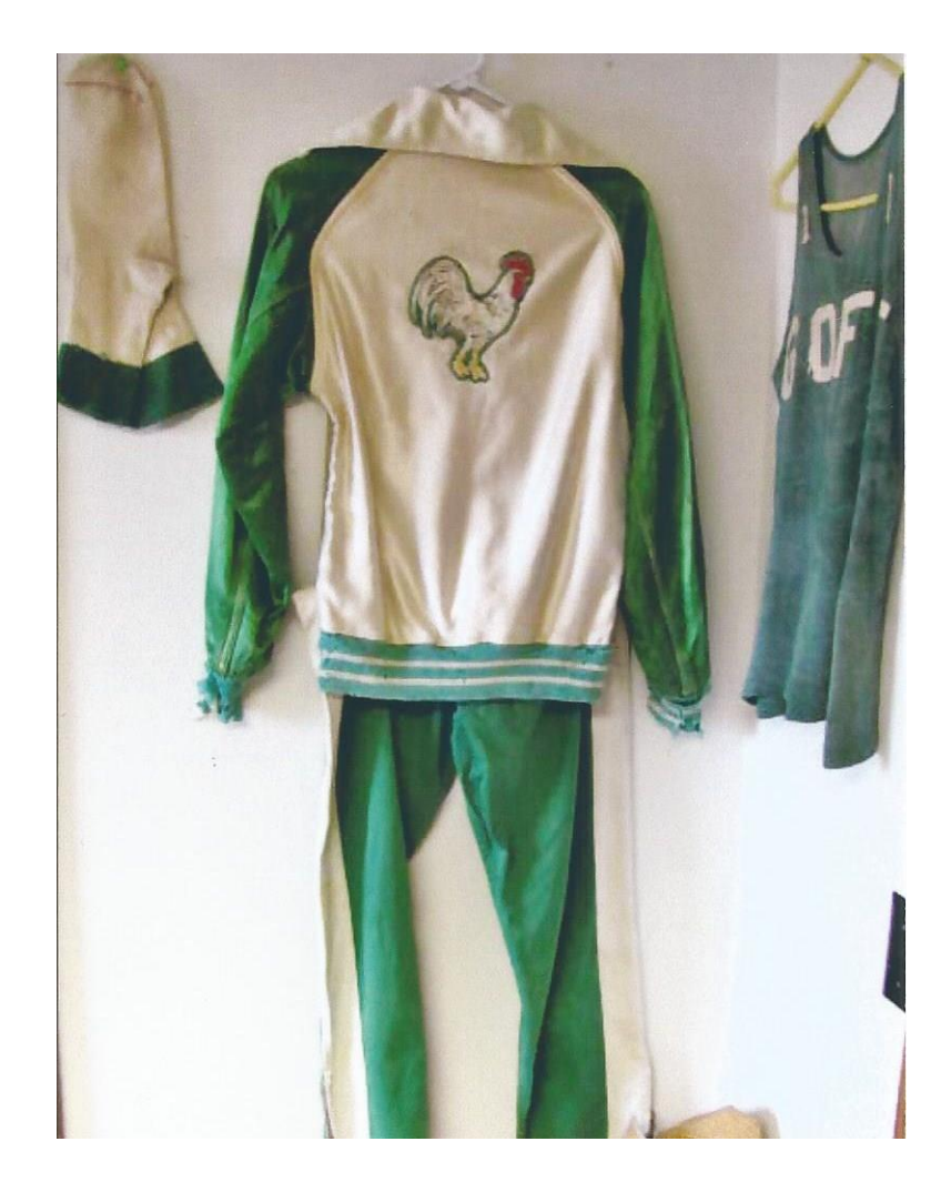
Figure 3. Photograph of a Goff High School men's basketball warm-up suit, featuring the school's mascot, the Chanticleer. The mascot was chosen to promote Goff's most prominent business, the Hanna Poultry and Egg Co.

One landmark that is still easily located today is the Great White Way that winds through the town. Now more commonly referred to as Highway 9, the road took over the town's original Second Street in the early 1920s, and served as a stop along one of the state's first auto trails. The highway became the busiest road in the town, and eventually was referred to as Main Street, instead of Stahl Street, which runs north and south in the center of Goff. The Great White Way received its name because of the bands of white that were painted on alternating telephone poles along the road, serving as guide for early automobile drivers on