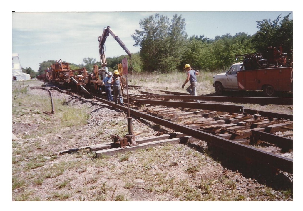
Figure 5. Photograph showing the Missouri Pacific Railroad's tracks being taken up right outside of Goff, Kansas, 1990. The only evidence left of the tracks are the raised, flattened stretches of land where the rails once lay.

The line was officially bought out by the Union Pacific Railroad in 1982. The new owners calculated that running through small towns like Goff was too much of an expense, so that year marked the last train through the town. By 1990, the rails were taken up, as seen in Figure 5 below.