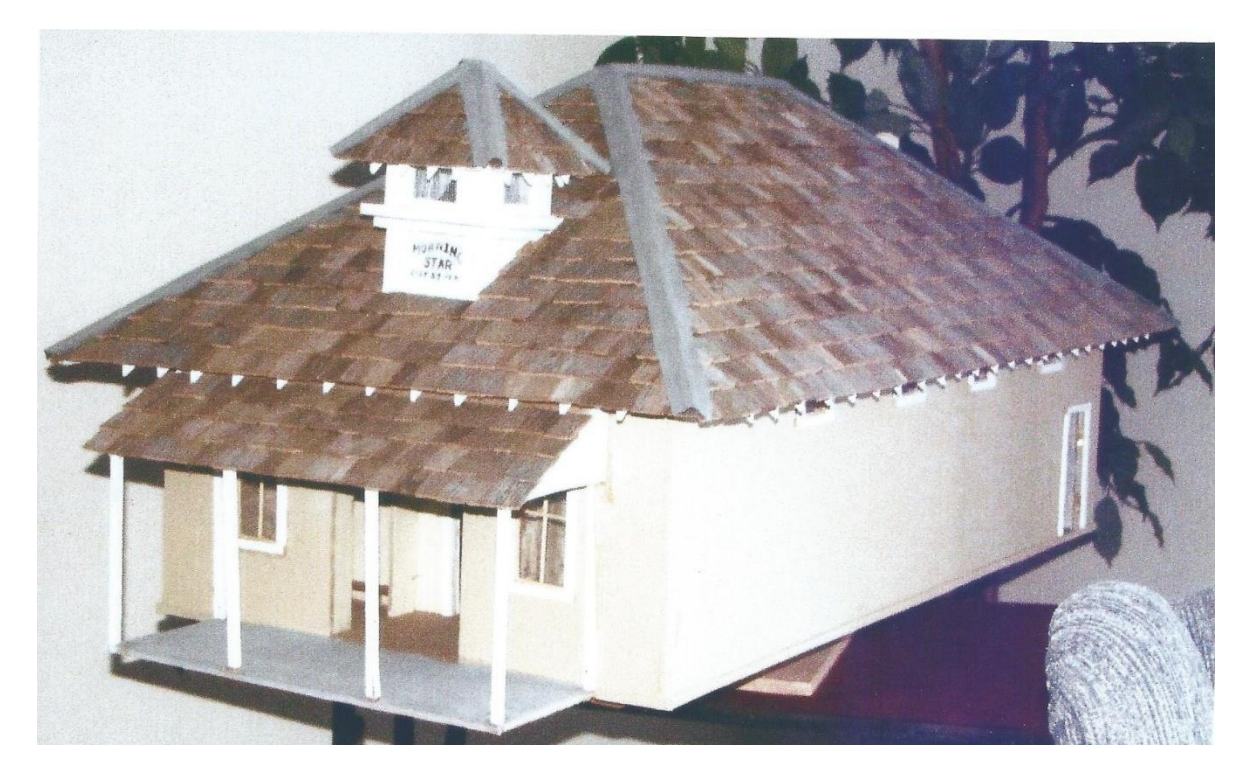
Figure 6. Photograph showing a scale model of the Morning Star Grade School, formerly near Goff, built by Mr. Roy Bell. Each of Bell's models sit on a turn table for multiple viewing angles and also have functioning doors, as well as trap doors in the roofs, to look into the insides of the buildings.