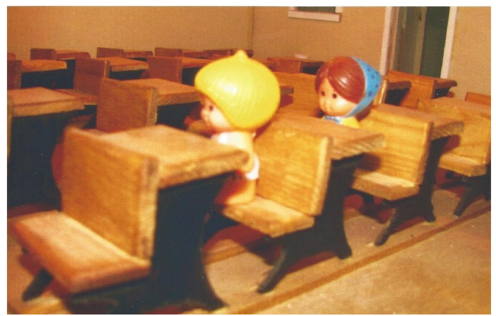
Figure 7. Photograph showing the student desks in Mr. Roy Bell's scale model of Morning Star Grade School. Bell constructed each desk by hand, as well as the teacher's desk and chair and blackboard, which can be seen from another angle. SOURCE: Personal collection of Roy Bell

Figure 6. Photograph showing a scale model of the Morning Star Grade School, formerly near Goff, built by Mr. Roy Bell. Each of Bell's models sit on a turn table for multiple viewing angles and also have functioning doors, as well as trap doors in the roofs, to look into the insides of the buildings. SOURCE: Personal collection of Roy Bell