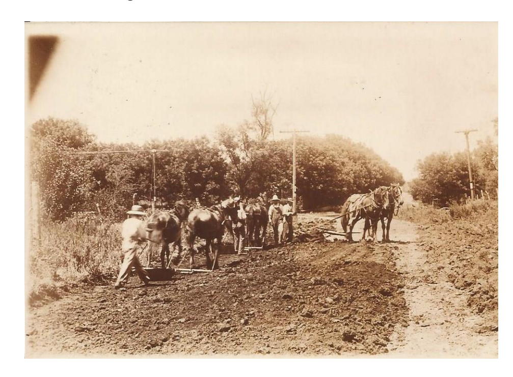
Figure 4. Photograph showing a road being built near Goff, Kansas, c. 1915. Roads like the Great White Way would have been built in a similar way, with the poles in the distance painted with bands of white to serve as a guide for drivers.

roads without any other identification.<sup>14</sup> The road was gravel until it was paved in the 1930s. At the time, roads were graded out using blades pulled by a team of horses before gravel was eventually poured, as seen in Figure 4 below.