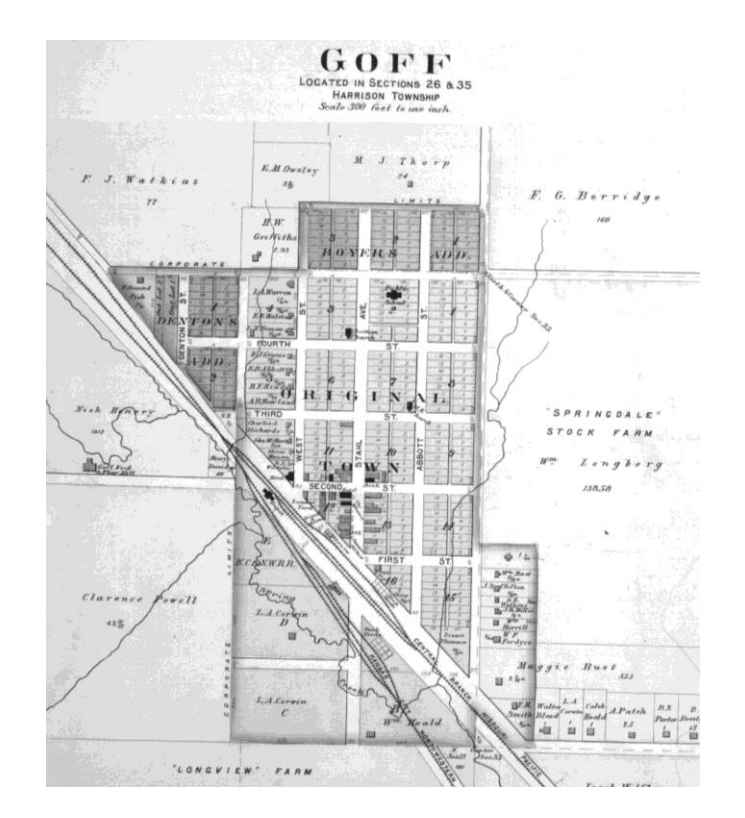
Figure 2. Plat map of Goff, Kansas, 1908. Notice the shaded additions to the west and north, showing the town's expansion since its original plotting a few decades before.

Built as a railroad town, Goff became a crossroads for the Central Branch of the Missouri Pacific (eventually Union Pacific) and the Kansas City, Wyandotte Northwestern (eventually Kansas City Northwestern) railroads. As the town grew, it expanded to the north and also the west along the railroad tracks, creating property sections with sharp angles that paralleled the rail lines. The tracks, as well as the two creeks, formed the main boundaries of Goff, as seen in Figure 2 below.