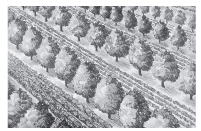
Figure 1. Schematic of alley cropping.