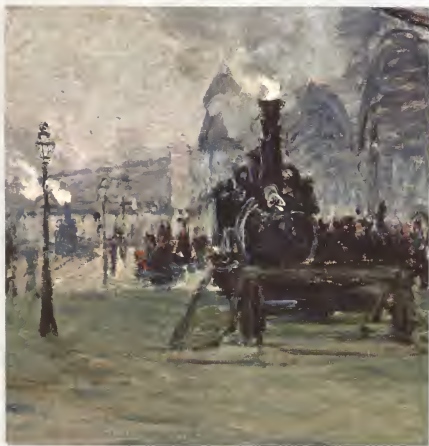
Claude Monet, Old St. Lazare Station, Paris (1877).

The great compound hissed and trembled . . . The engine moved, advanced, travelled past the depot and the freight train, and gathering speed, rode out on the track beyond. Smoke, black and boiling, shot skyward from the stack; not a joint that did not shudder with the mighty strain of the steam; but the great iron brute . . . came to call, obedient and docile as soon as ever the great pulsing heart of it felt a master hand upon its levers. It gathered its speed, bracing its Steele muscles, its thews of iron, and reared out upon the upon track, filling the air with the rasp of its tempest-breath, blotting the sunshine with the belch of its hot, thick smoke. 40