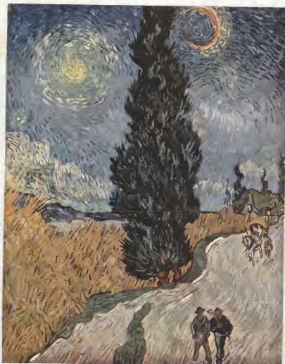
Vincent Van Gogh, The Way with the Cypress and the Star .

At length, the day broke, resplendent, cloudless. The night was passed. There was all the sparkle and effervescence of joy in the crystal sunlight as the dawn expanded roseate, and at length flamed dazzling to the zenith when the sun moved over the edge of the world and looked down upon all the earth like the eye of God the Father. 42