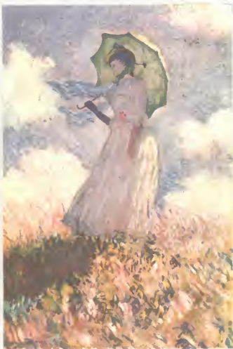
Claude Monet, Woman with a Sunshade (1886).

. . . he saw her in a glory of sunlight that set a fine tinted lustre of pale carnation and gold on the silken sheen of her white skin, her hair sparkled with it, her thick, strong neck, sloping to her shoulders with beautiful full curves, seemed to radiate the light; her eyes, brown, wide, innocent in expression, disclosing the full disc of the pupil upon the slightest provocation, flashed in this sunlight like diamonds. 38