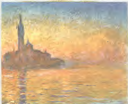
Claude Monet, San Giorgio Maggiore at Dusk (1908).

It was late in the day, already his shadow was long upon the padded dust of the road in front of him. On ahead, a long way off, and a little to the north, the venerable campanile of the Mission San Juan was glinting radiant in the last rays of the sun, while behind him, toward the north and west, the gilded dome of the court-house at Bonneville stood silhouetted in purplish black against the flaming west. 39