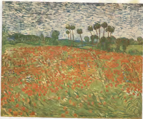
Vincent Van Gogh, Poppies .

. . . then as the buds opened, emphasizing itself, breathing deeper, stronger. An exquisite mingling of many odours passed continually over the Mission, from the garden of the Seed ranch, meeting and blending with the aroma of its magnolia buds and punka blossoms. 41