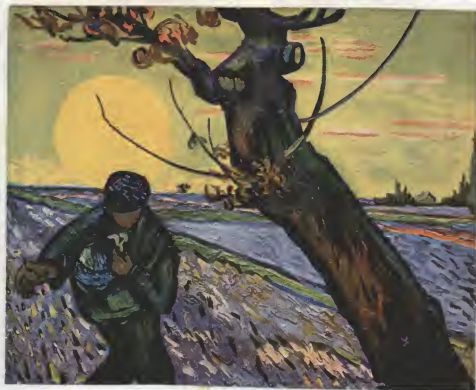
Vincent Van Gogh, The Sower .

Now the sky was without a cloud, pale blue, delicate, luminous, scintillating with morning. The great brown earth turned a huge flank to it, exhaling the moisture of the early dew. The atmosphere, washed clean of dust and mist, was translucent as crystal. Far off to the east, the hills on the other side of Brodersen Creek stood out against the pallid saffron of the horizon as flat and as sharply outlined as if pasted on the sky. The campanile of the ancient Mission of San Juan seemed as fine as frost work. All about between the horizons, the carpet of the land unrolled itself to infinity. But now it was no longer parched with heat, cracked and warped by a merciless sun, powdered with dust. The rain had done its work; . . . 37