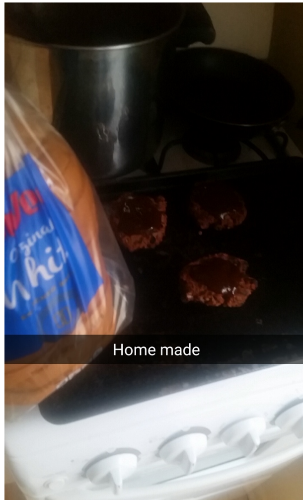
Figure 4.4 Kyle shares his meal prep process

These are black bean burgers. What I was trying to show is that when I do make food, I make it in bulk. And then, that's the cheapest bread on the market - It's just a dollar. So its just showing that I need to be practical with meals and not buy, like, luxury items. I'll make like 30 of them and freeze them and then they'll last me up to a year if I need them to.