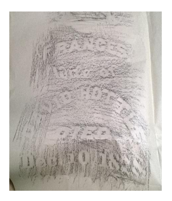
Figure 8: A grave etching of the tombstone photographed in Figure 7. SOURCE: Etching by author December, 2013. Note: The headstone belonged to one of the longest lasting more prominent families in Oak Mills.