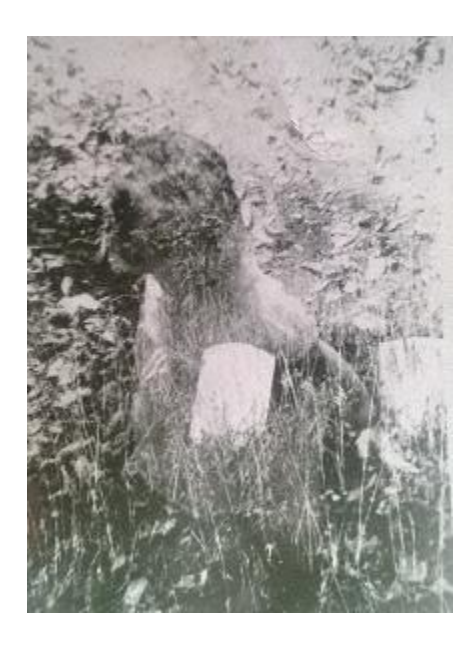
Figure 7: A photograph of a gravesite located in Hottle Family Cemetery, Oak Mills, KS. Circa 1980. Note: the spectral image sitting atop the headstone. The day after the image was taken the gravestone was mysteriously knocked off its base.