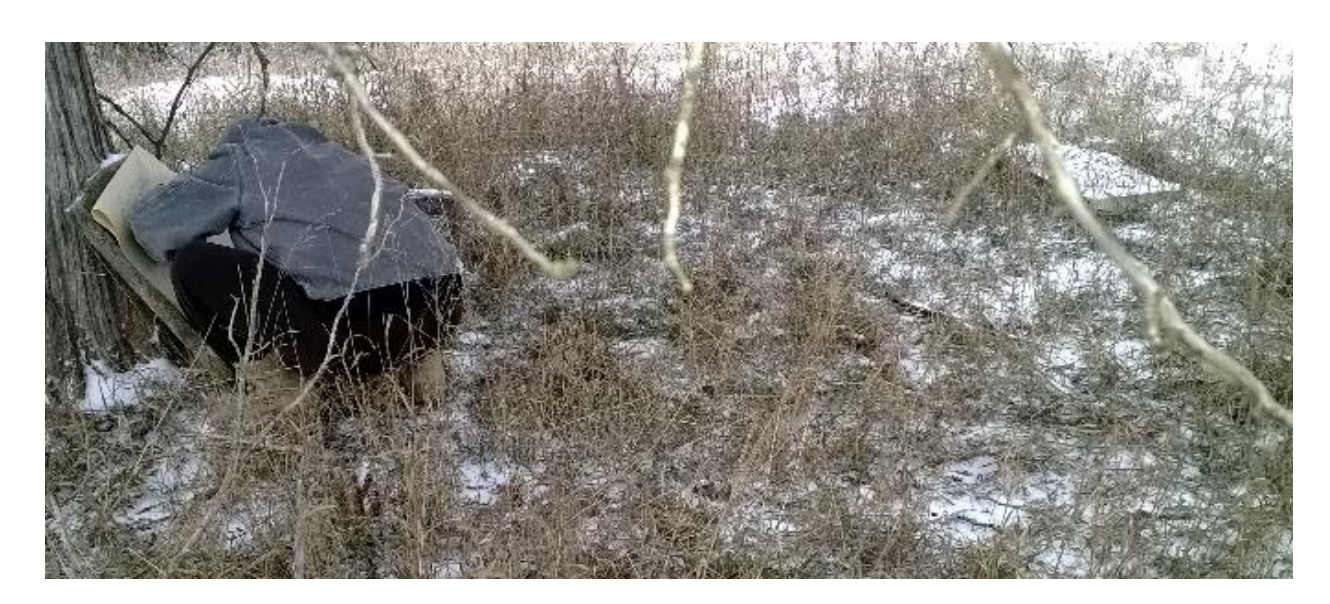
Figure 9: A photograph of the author etching the headstone of Francis Hottle at the Hottle Family Cemetery, Oak Mills, KS. Note: The broken base of the ghost image headstone lies to the right of the author as well as another 200 lb. headstone that was also found mysteriously knocked over.