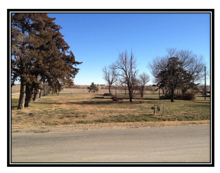
Figure 4. The original location of the cheese factory. Photo taken by Kaitlyn Harlow on November 9, 2012.

In 1880, until a local worship place could be established, the members of the Church of the Brethren organized the Chapman Creek Church at the Demming School north of Abilene. Around this time, a road extended north from Abilene to what is now Kansas Highway 18 and cut diagonally to what is now the center of the Buckeye community at the intersection of Jeep Road and 3100 Avenue. 9 The Chapman Creek Church gained its own four acres in April 1883 at the northwest intersection of Jeep and 3100 and continued to grow and actually obtained an organ in 1889. 10 The prosperity was on the rise.