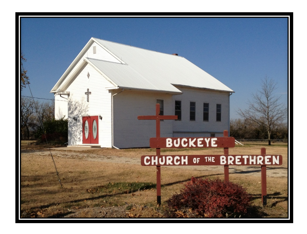
Figure 3. A photograph of the Buckeye Church of the Brethren, which is still used and maintained by members of the church. Photo taken by Kaitlyn Harlow, November 9<sup>-,</sup> 2012.

There was continued growth in the area as more men encouraged people to head to the west to stake claim in property; some were even promised half-price train tickets. What the men did not warn people about was the devastation of drought, flood, or even grasshoppers. In the year 1874, a disaster occurred when there was an invasion of Rocky Mountain grasshoppers. They ate everything in their path, even the fuzz off the cottonwood boards and netting from farmhouse windows. The only thing that the grasshoppers did not destroy was a small patch of tobacco. There were stories of how hoards of grasshoppers gnawed through rake handles, destroyed a peach crop, and did devastating destruction in a wheat field. Stories describe how the grasshoppers came in groves and looked like dark clouds moving across the sky. Although they were gone in a couple of days, the devastation was left behind.