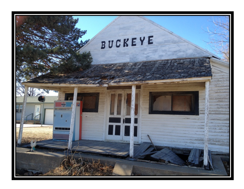
Figure 1. Photo of Buckeye store, taken by Kaitlyn Harlow, November 9, 2012.

Kaitlyn Harlow HIST 557 Bonnie Lynn-Sherow Fall 2012