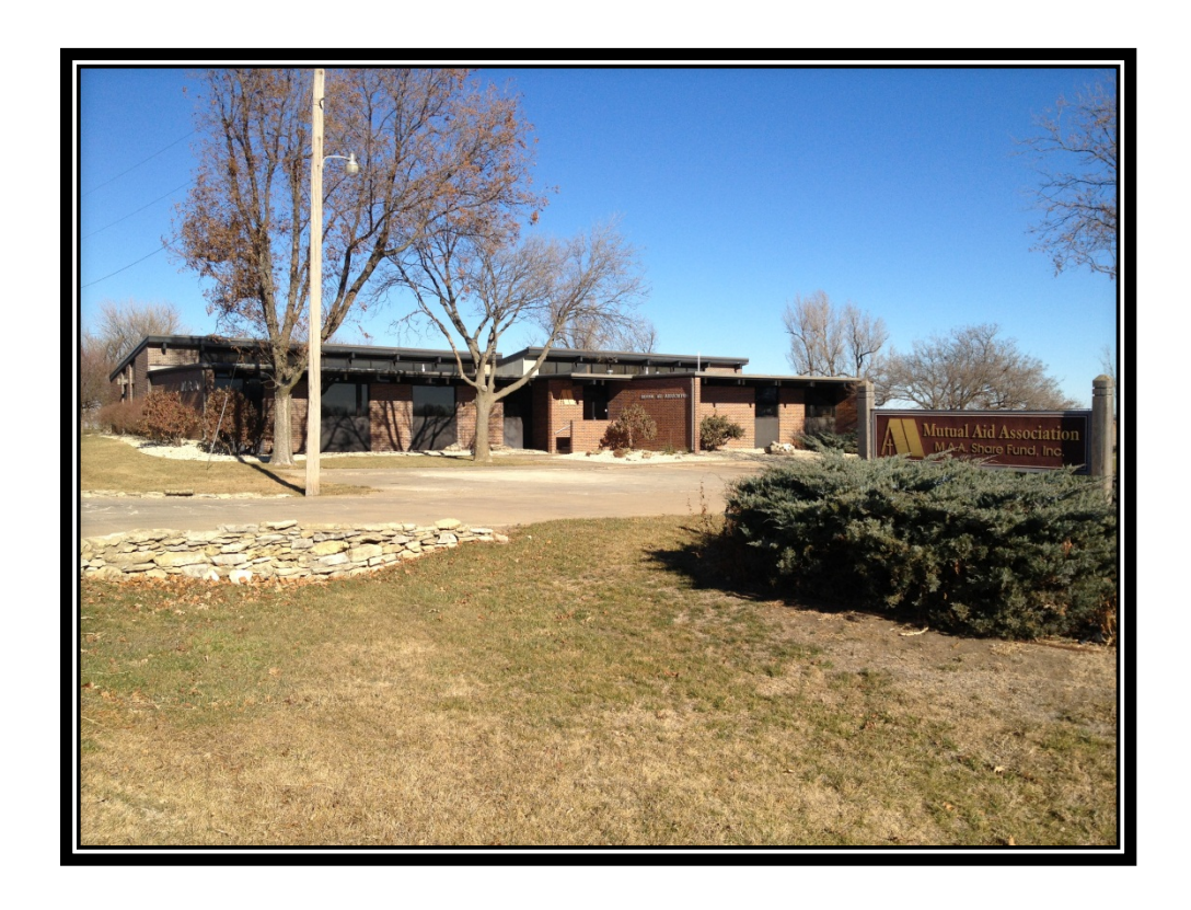
Figure 6. Present-day photo of the Mutual Aid Association Insurance Company building.

school close to Buckeye. The children were taken to Dickinson County Community High School in Abilene on Monday through Friday, and then taken back to Buckeye for the weekends. 19