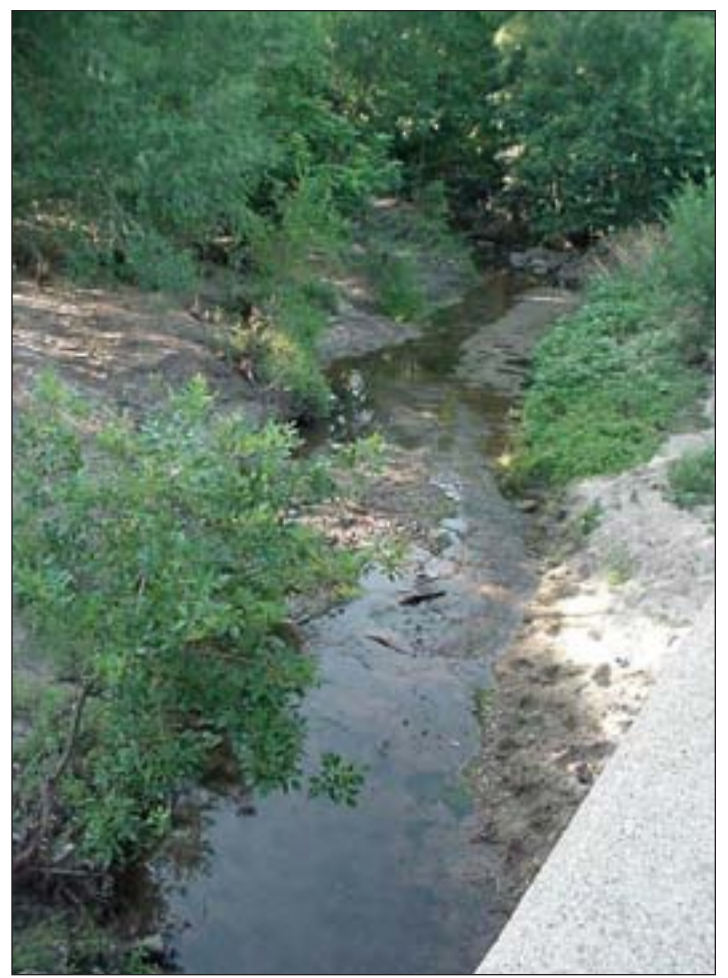
Figure 5. Red Rock Creek.

Howard Miller Cheney Lake Watershed Inc.