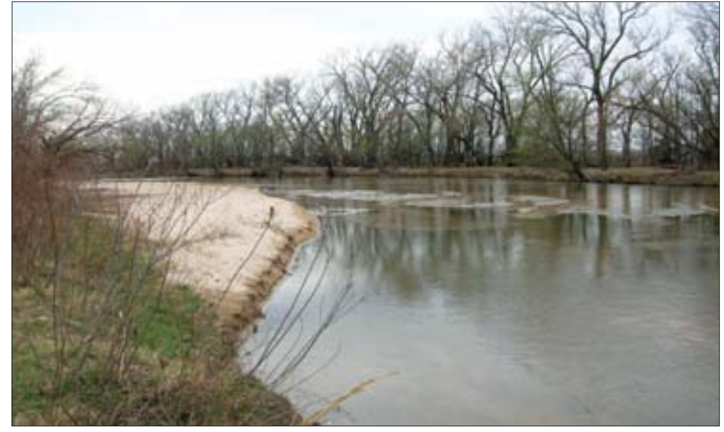
Figure 2. North Fork Ninnescah River near Pretty Prairie, KS.

There has been extensive surface water monitoring within the watershed. Surface water monitoring began in 1962. Since that time, The KDHE has continued monitoring a number of locations in the watershed (KDHE, 2000c). Between 1975 and 1999, the KDHE participated in eight Cheney Lake water quality surveys. The KDHE reported that the watershed is ranked seventh throughout the state of Kansas in priority for watershed restoration and has established TMDLs for eutrophication and silt. They determined the primary source to be runoff from agricultural fields. Throughout the years of monitoring, chlorophyll a (a measure of