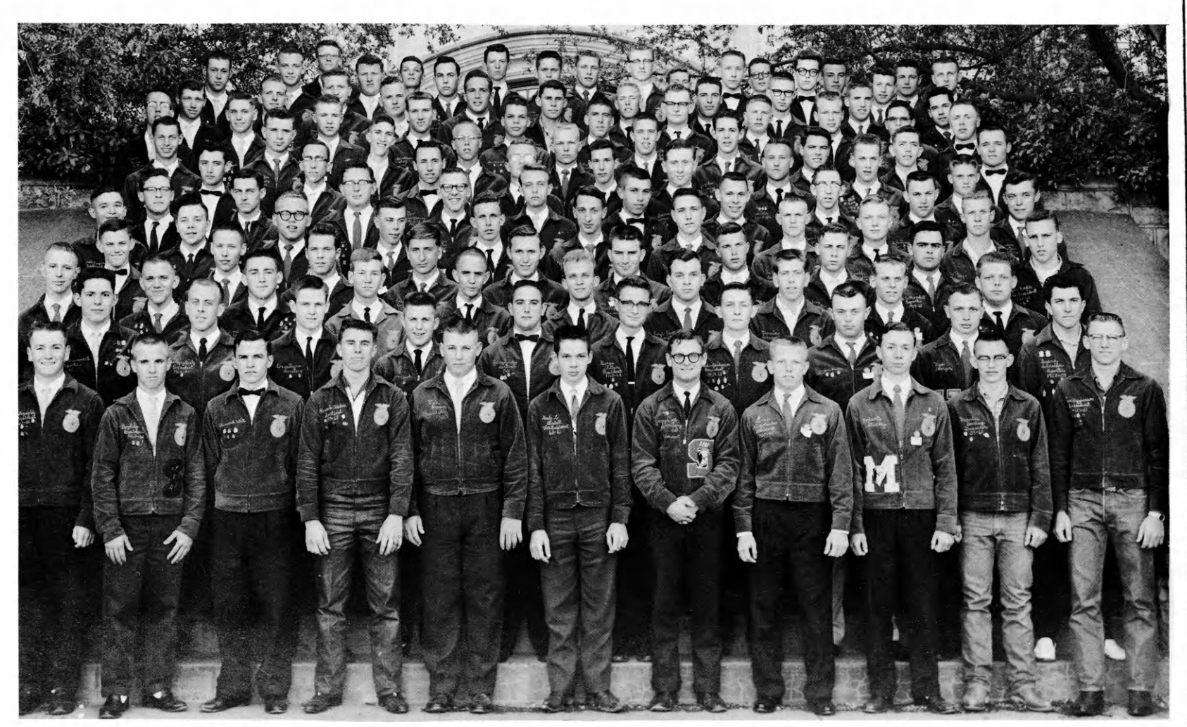
Kansas' 1961 State Farmer Class - 132 members from 86 chapters received degrees.