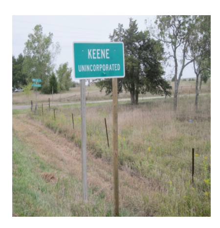
Figure 2: Sign indicating location of Keene, Kansas.

If a person drives westward from Topeka along Kansas Highway 4, they might unknowingly pass through the remains of Keene in Wabaunsee County, Kansas. The only object notifying them of their arrival into this tiny community is a small sign reading: "Keene; Unincorporated." Upon seeing this sign, the driver might wonder where exactly the town was and then realize that they had just bypassed Keene. Nothing now remains of the once thriving town except a small sign. But, there is more to this town than that sign, if we choose to study its past.