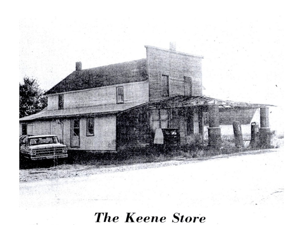
Figure 1: Photo of Keene Store during the 1950s.