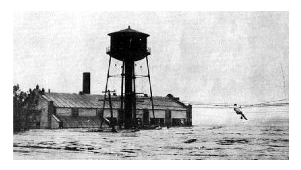
Figure 2: Photos demonsrating damage from the repeatedly flooding Republican River which caused the eventual undoing of Sherman. It was not economically feasible to keep rebuilding every time the river folded. Circa 1930s.

If the floods of the early 1900s had never occurred, or at least not to the extent to which they did, Sherman could still have been a town that thrived and grew through industrialization. As of 1990, it was reported that only 37 families resided in what was Sherman, a major decline from its peak population in 1884 of over a thousand.<sup>11</sup> Twenty years later, there are likely even fewer people left.