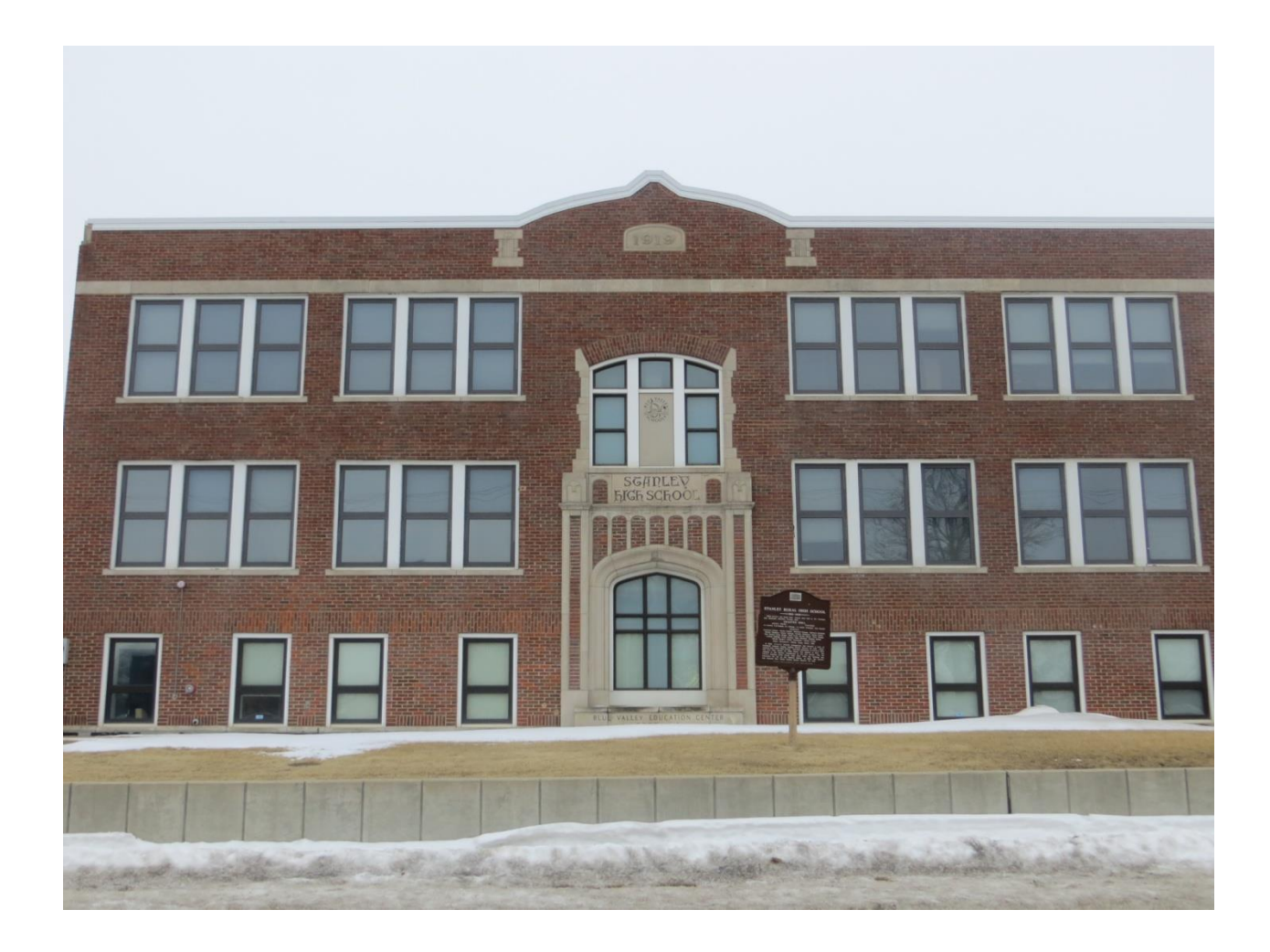
Figure 4. A photograph of Stanley High School as it is today.

home Stanley provided that cemented such pride in its citizens. Those folks may have become official residents of Overland Park, but Stanley will always be their home. Their pride in their town will always persist, no matter what the address reads.