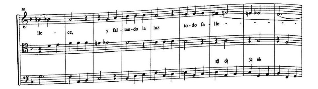
Figure 4: Mvmt. 16, mm. 38-46

She asks for us to feel the suffering of the Earth without the sun: