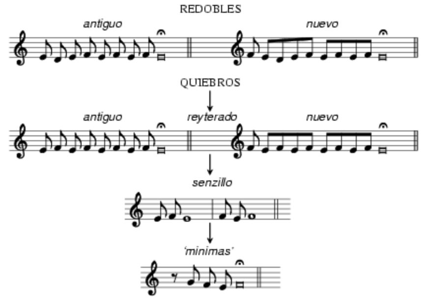
Figure 2: Ornaments from Tomás de Santa María: Arte de Tañer Fantasía (1565)

Ex.2 Ornaments from Tomás de Santa Mar a: í Arte de tañer fantas a(1565)