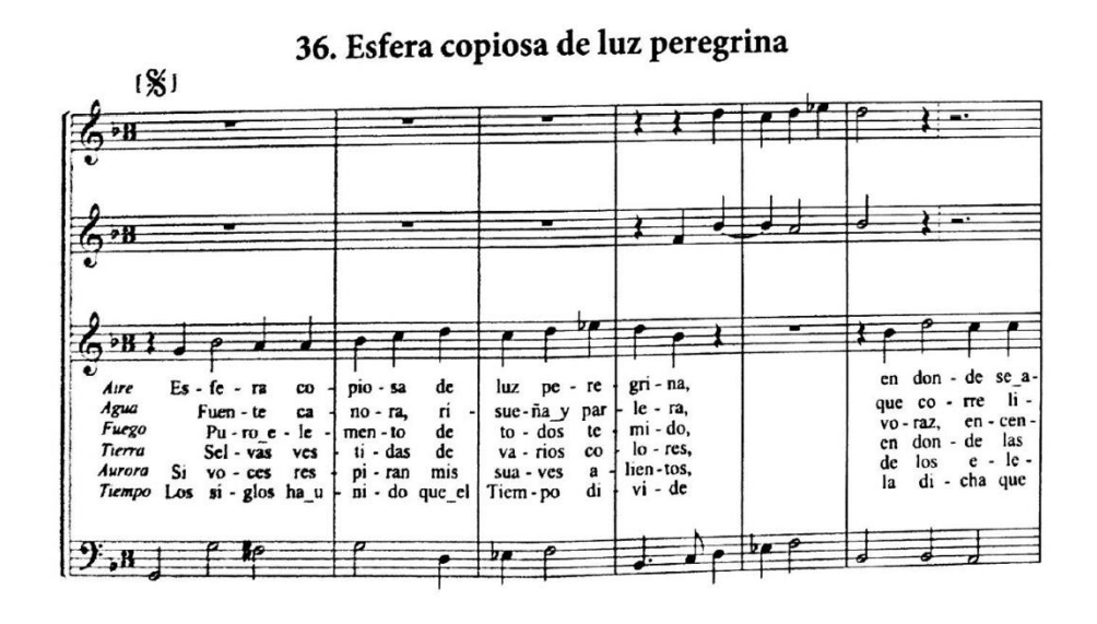
Figure 6: Mvmt. 36, mm. 6

Movement 36 is the finale, where all the elements, dawn, time, and the chorus join to celebrate the sun's return. This movement is in two sections: solos and chorus in verses. It alternates between each of the four elements as well as dawn and time singing solo verses and the chorus's response. The solo verses are filled with hemiolas in a meter of 3 that create a sense of push and pull in each strophic line: