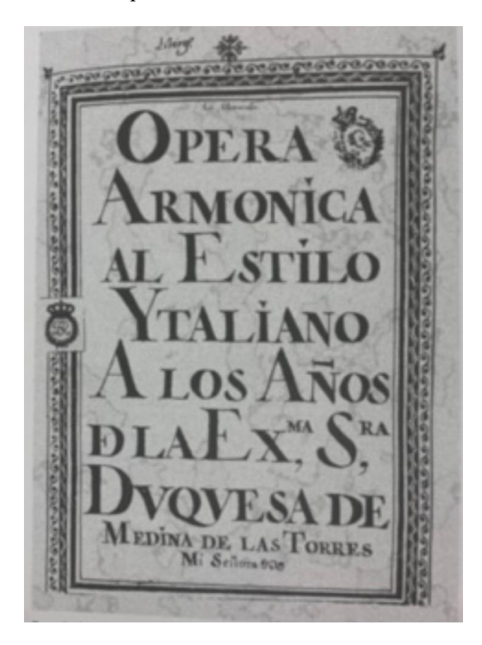
Figure 1: Cover of commemorative copy of Los Elementos <sup>47</sup>

work's premiere this title was placed on the work or by whom.<sup>45</sup> On the illustrated cover for the surviving, commemorative score for Los Elementos , "italiano" is misspelled as "ytaliano" which could imply that the title was added to the work more in the court's popular interest in Italianate music/opera more so than Literes's composorial intent.<sup>46</sup>