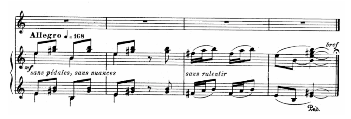
Figure 1.1 Last four bars of "Le Dromadaire"

This piece must have a great sense of legato, emulating the camels roaming the world. The accompaniment has a falling pattern in the left hand representative of Don Pedro, a famous fifteenth century Portuguese explorer, and his camels' ever-slow progress of exploration. There is a four bar tag at the end suggestive of a brief spark of emotion before sauntering into the Tibetan goat's domain.