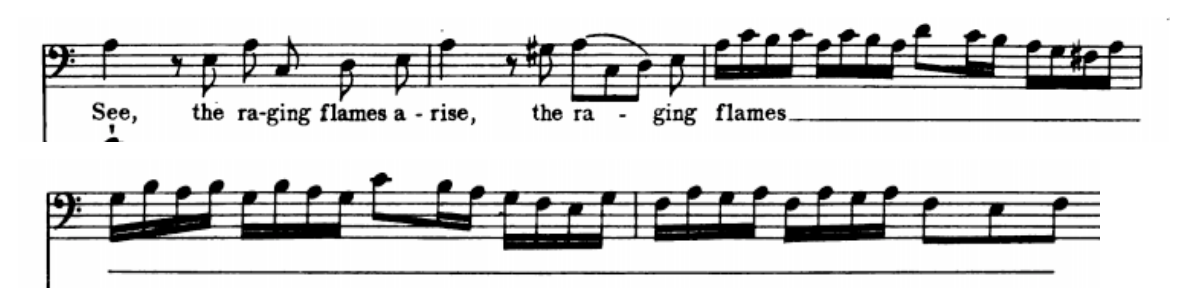
Figure 2.1 An example of a melismatic passage

The rhyme scheme of the recitative is AABBCC. It is a very declarative, demanding recitative, and should drive forward until Caleb remembers the Rahab and his assistance. <sup>40</sup> The air, "See the raging flames arise", shows great vocal text painting as the vocal melismas imitate the raging flames, specifically written for Antonio Montagnana, an eighteenth century Italian Bass. <sup>41</sup> The rhyme scheme of this text is AABB, and the aria is in ABA form. Handel chooses to use the opposite of his fiery melismatic passages and emplores legato singing to relfect the text, "dismal groans and cries." The song concludes with a flourish in the orchestra as Handel musically depicts Caleb's destructive forces obliterating the city. The air is marked Allegro, with a suggested meter of quarter note equal to 120. Ultimately the tempo depends on the performer and how fast his voice can manipulate the melismatic passages. The final cadenza, "proud Jericho hath met her doom," demands appropriate melismatic improvisation as Caleb and his forces raze the city to the ground.