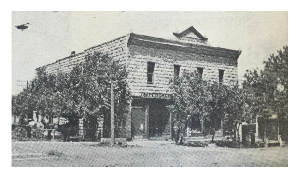
Figure 3. A photograph showing Pearl Opera House as it appeared in 1910. Note the ornamental, triangular inscribed sign on top of the building. Note also the horse and buggy hitched to the left and the carefully-planted trees.