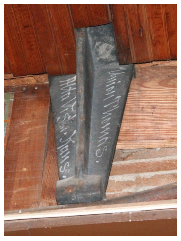
Figure 10. A photo showing the names "Union Thomas" and "Alta Vista, Kansas" written on a support beam above the stage inside the Pearl. December 2015.

Whether an opera house was built in a town of 400 or 400,000, it had the ability to make a difference. A "Saturday night theater" brought an isolated rural population closer together and helped to create a sense of community. That is exactly what Pearl Opera House, now 112 years old, has done for the town of Alta Vista, Kansas.