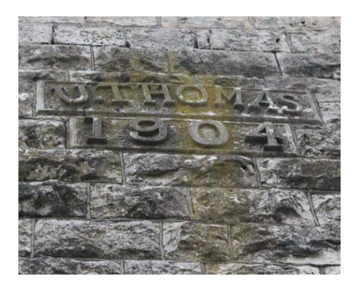
Figure 9. A photograph showing Union Thomas' name on the outside of the Pearl Opera House. December 2015.