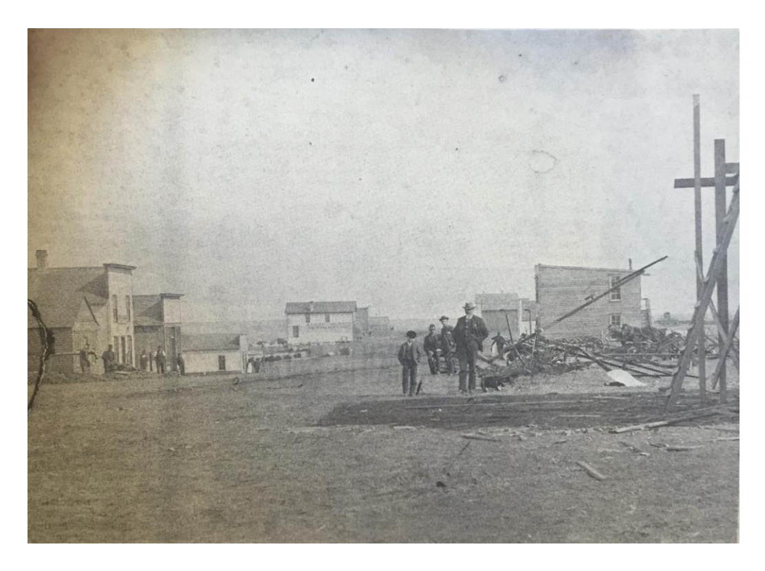
Figure 2. A photograph of the main street view in Alta Vista in 1887.

As shown in Figure 2 above, Alta Vista's main street in 1887 looks more like a dilapidated and run down place than that of a town on the verge of development. However, soon after, more businesses would move in and be built on the main street, making way for the installment of the Pearl Opera House.