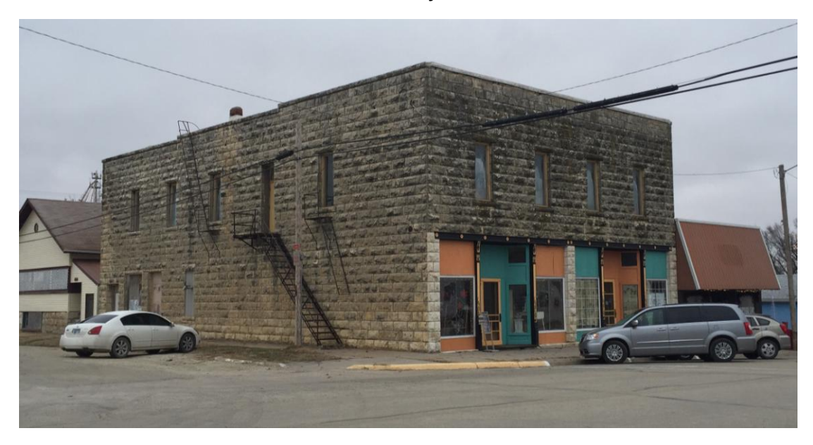
Figure 4. A photograph showing the Pearl Opera House as it appears today in 2015. Across a century, the ornamental sign, trees, and stone archway have all disappeared.

As seen in Figures 3 and 4 above, a lot has changed in Alta Vista since 1910 but the original building constructed by Union Thomas still stands.