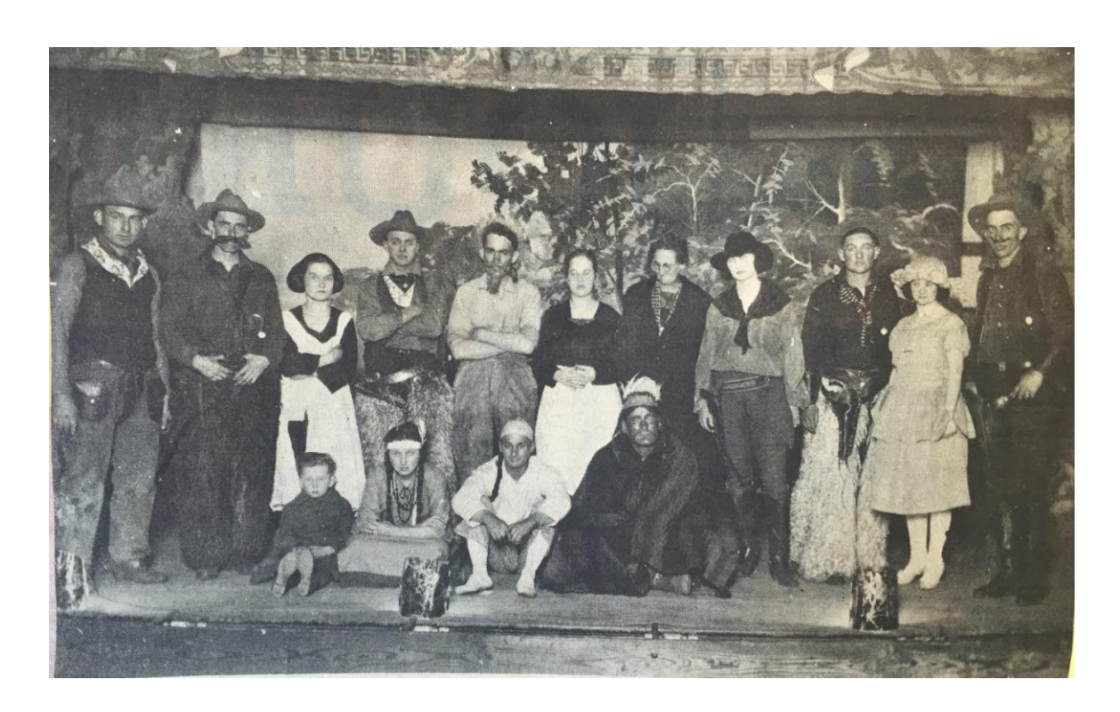
Figure 6. A photograph showing the cast of a local production called "Arizona Cowboy." Just visible above the stage may be part of the old, printed canvas scroll-down curtain.

Along with moving pictures and different traveling acts that would come to the Pearl, local theater was also performed there. School productions as well as other local performances would be held in the opera house. As seen in Figure 6 below, in 1919, the play "Arizona Cowboy" was performed by local talent and shows the cast in costume on the stage at the Pearl.