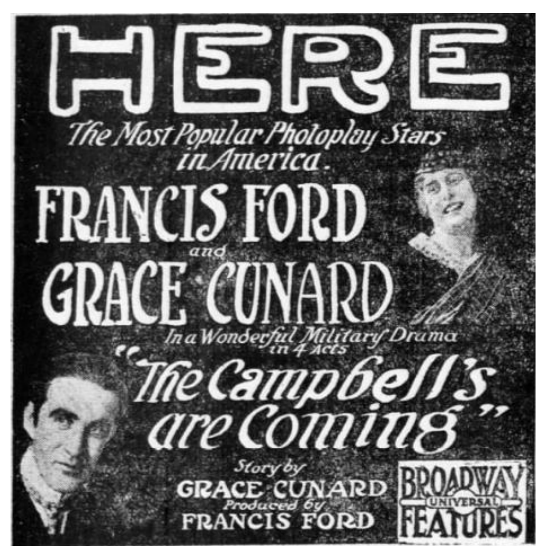
Figure 5. A picture showing an advertisement for a moving picture to be shown at the Pearl in 1916.

As shown in Figure 5 above, the town of Alta Vista was always very excited to be showing a moving picture starring two of the most popular actors of that time. Ads for the movies were often large in their local newspaper.<sup>17</sup>