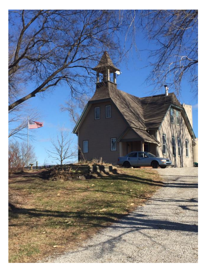
Figure 3. This photo shows the old schoolhouse that was in Menoken on Menoken Rd. It is now a residence and people live in it to this day.

Another important factor in Menoken's decline was competition with the larger neighboring towns and cities like Silver Lake and Topeka, especially after the arrivals of automobiles. The last time Menoken appears in the Polk Gazetteer and Business Directory is the year 1900, when it had a population of 14. It is not listed in the 1912 edition. This caused people to migrate to shop and live in larger cities, leaving Menoken empty. Although Menoken is now almost forgotten, there are still traces of it everywhere in northwestern Topeka. Whether it be road and township names, school and cemetery, or just the culture that was left behind by the settlers of that area, Menoken will never be completely gone. It is important for us to know about these vanished places in order to understand why things are the way they are today.