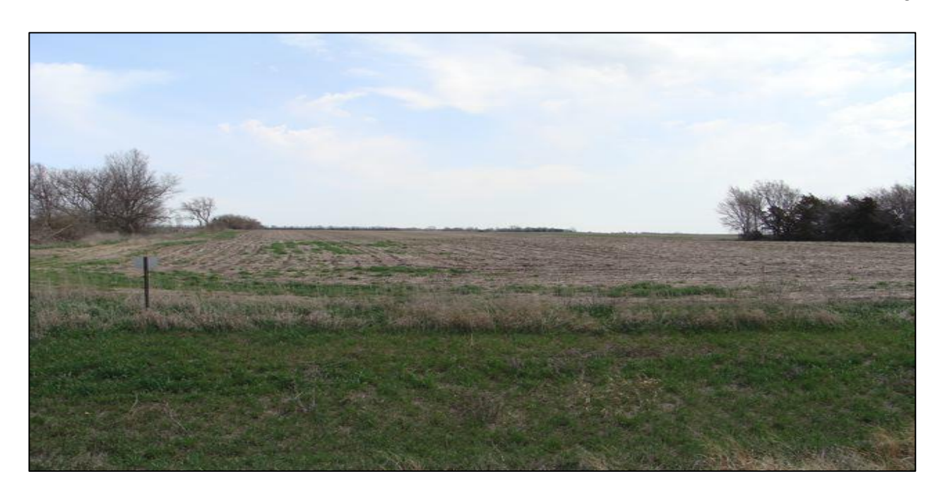
Figure 2. A photograph depicting a field in the Hochfeld, Kansas, settlement located three miles north of Goessel, Kansas. Notice the hedges on both sides of the field that create a thin strip of land remnant of the original land distribution used in Hochfeld c. 1874. Photo taken by Bette Jo Lehrman, April 9, 2013.