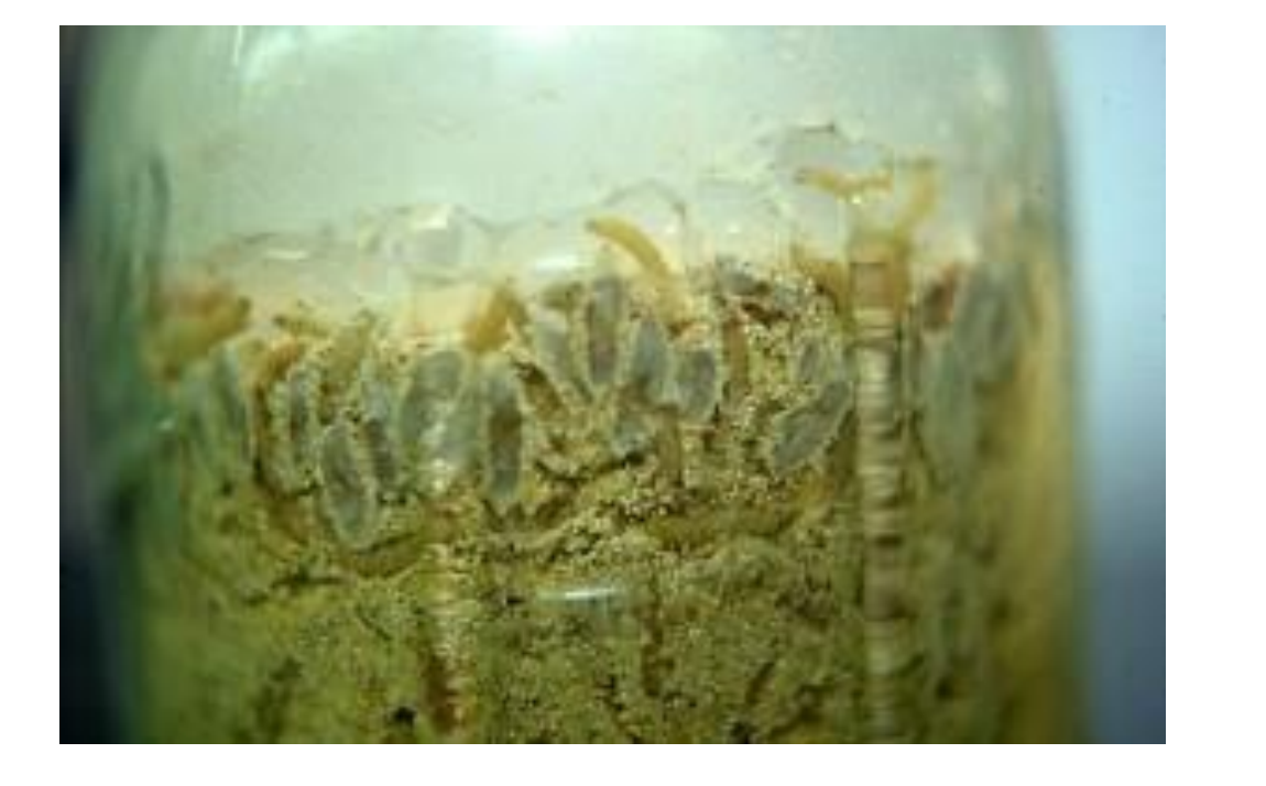
Fig. 3-6, top, left to right, ground experimental dog foods A, B, C and D. Fig. 7, bottom, left, IMM lab diet. Fig. 8, bottom middle, plastic box, from top, for two-choice bioassay with lab diet on left and dog food on right; black circle is where eggs were deposited. Fig. 9, bottom right, a laboratory colony of IMM showing mature larvae like those counted in our no-choice and two-choice studies.