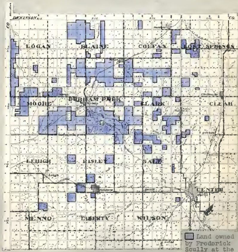
Map 3 Scully land in Marion County

Marion County with the exception of nine southern and eastern townships and the east half of Clear Creek Township.