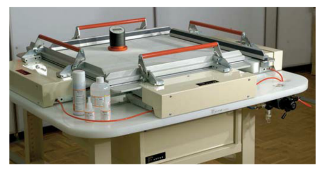
A skilled miller needs to identify the direction of the weave before stretching the cloth across the sieve for the approriate sieving result.

used to define the technical aspects of the material. Three important terms are thread diameter, thread or mesh opening, and percent open area.