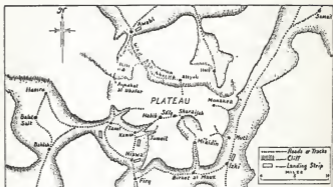
Fig. 5. The Omani interior c. 1959: the area around Niwva.