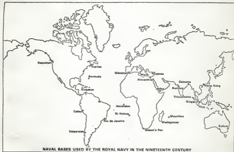
Fig. 2. Naval bases used by the Royal Navy in the nineteenth century