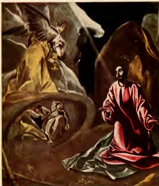
Agony in the Garden Detail El Greco, 1548-1625, Spanish Artext Junior No. 331. Photographed in color from the original painting in the National Gallery, London. Artext Prints, Inc., Westport, Conn.