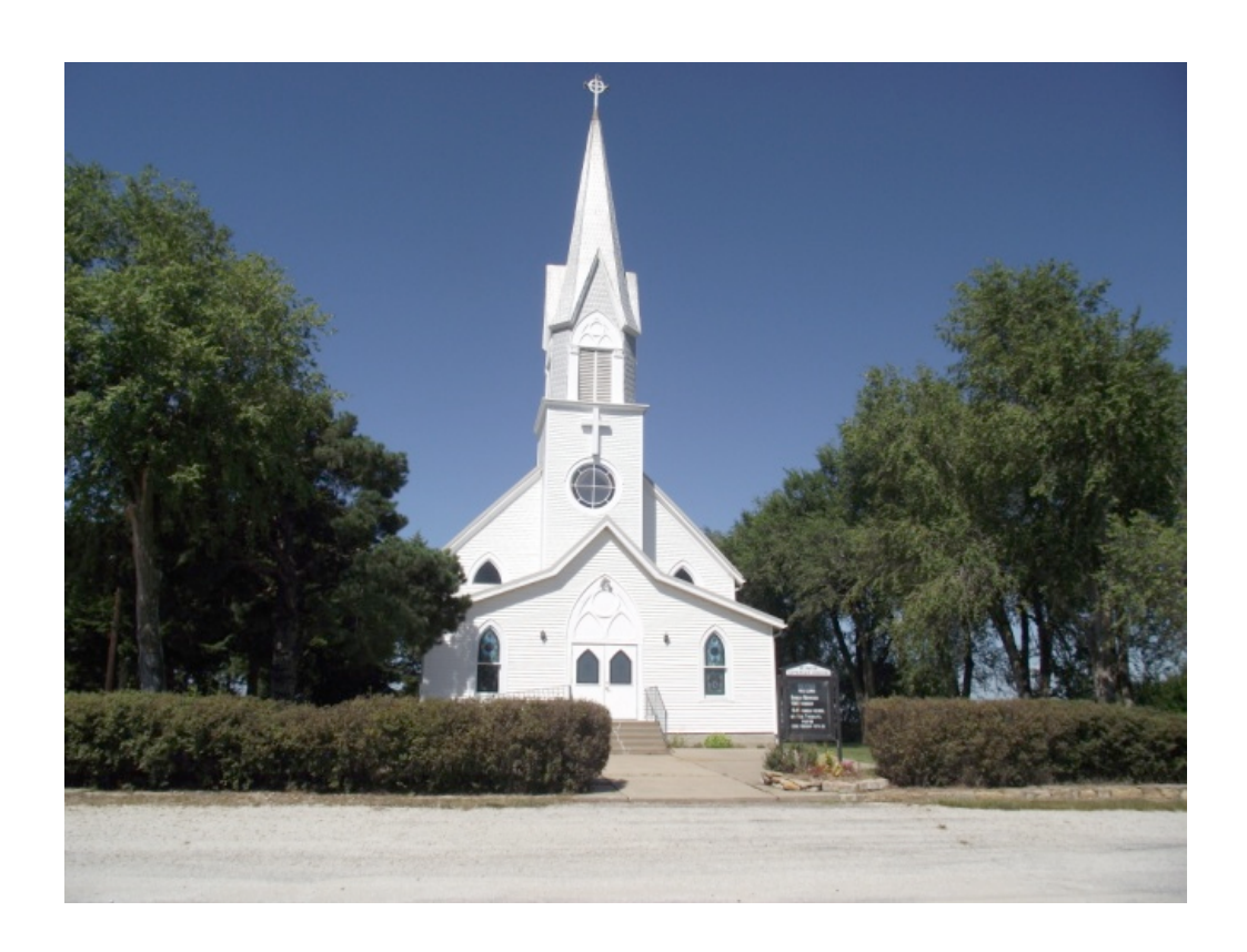
Figure 1 <u>Church</u>: St. Paul's Lutheran Church established 1875.