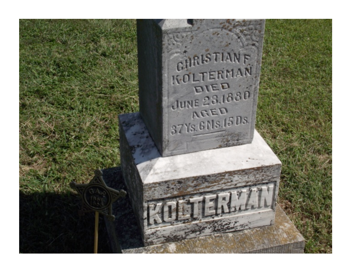
Figure 3 <u>Gravestone</u>: Christian Kolterman's Gravestone – Civil War Veteran.