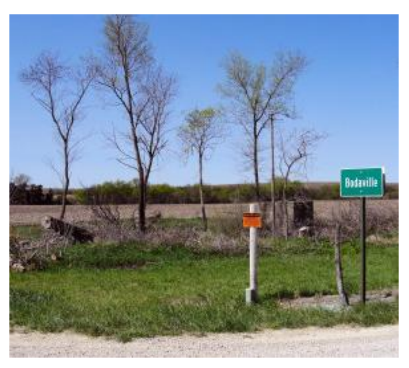
Figure 3 : A picture of Bodaville on April 22, 2015. This corner shot shows what modern day Bodaville looks like. Fields lie waiting for spring planting behind what used to be the town store. There is only around an acre left of the old town site, and some cement foundations signal the old store. All that marks the community is a small sign and a rock with the word, "Bodaville," engraved on it (not visible in photograph).

guide the author right to it and share memories of it in its last decades. A photograph of what Bodaville looks like today can be seen below in Figure 3. In the end, the land remains, and for so many immigrants, land ownership in the New World was the core of the American Dream.