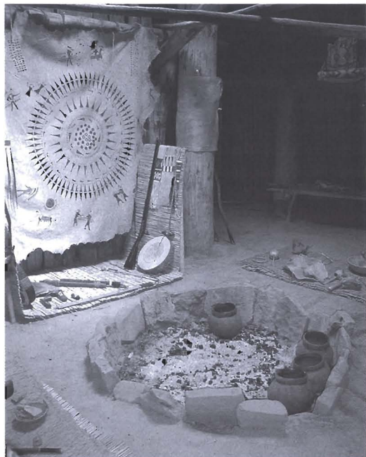
FIG. 6. Interior of a Hidatsa earthlodge replica at Knife River Indian Villages National Historic Site, North Dakota. The painted buffalo hide depicts the war exploits of Mandan Chief Four Bears.