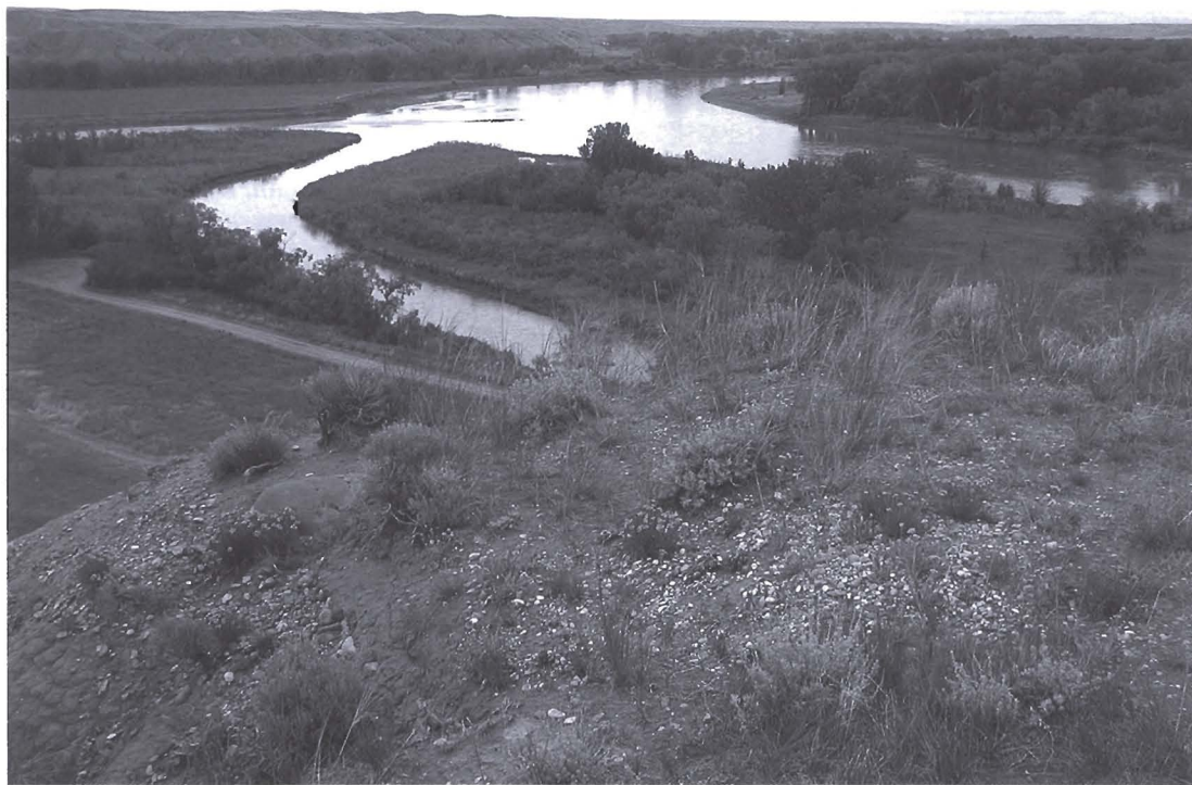
FIG. 2. Decision Point, Montana, at the confluence of the Marias and Missouri rivers. The Marias enters the Missouri in the upper left of this northeasterly view, just downstream of the large island in the Missouri.

memory." 21 Some markers may last only a couple decades, while statues and monuments made of steel or stone may interpret a version of events to multiple generations.