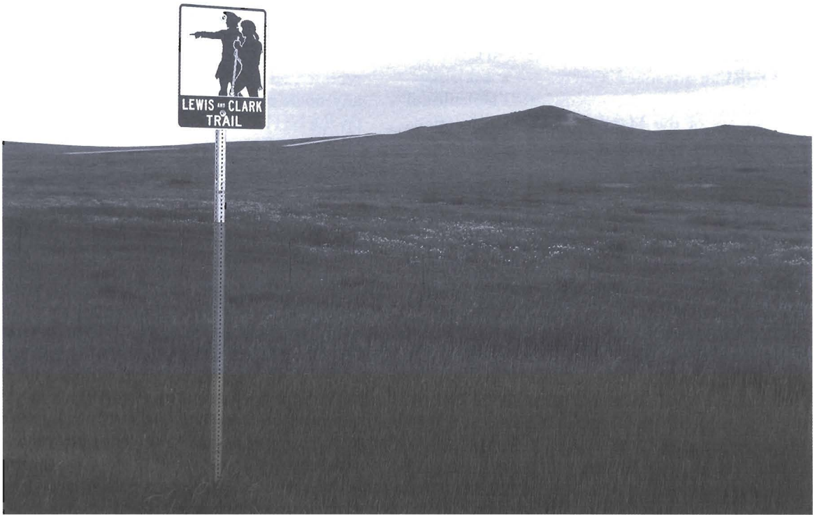
FIG. 1. Signs like this one on South Dakota Highway 1806 near Fort Pierre National Grassland mark the Lewis and Clark National Historic Trail. All photographs by the author, June 2003.

and Clark Expedition expressed a different message to Plains Indians than to those in the mountains or coastal regions because much of the Great Plains had recently been claimed by the United States in the Louisiana Purchase.