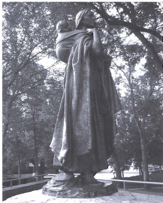
FIG. 7. Sakakawea statue on the North Dakota State Capitol grounds in Bismarck. Sculpted by Leonard Crunelle and erected in 1910 by the Federated Clubwomen and schoolchildren of North Dakota.

along the trail since she is the only woman and usually the only depicted Native American. 40 Her image has transcended her original role in multiple reinterpretations of what she meant to the expedition. Like the Good Neighbors representation, the Sacagawea Reinterpreted theme is a widespread element in the NHT interpretation, but it is strongest from northern South Dakota to Great Falls.