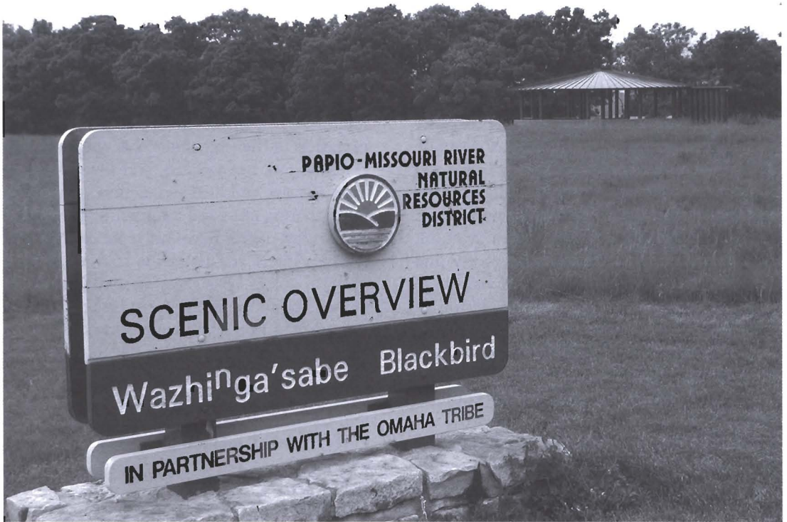
FIG. 8. Blackbird Scenic Overview alongside US Highway 75 on the Omaha Indian Reservation north of Decatur, Nebraska. The site was developed in partnership between the local natural resources district and the Omaha Tribe. This location overlooking the Missouri River is a sacred place, near the burial site of Chief Blackbird of the Omaha. The interpretive shelter in the background symbolizes an Omaha earthlodge. Interpretive displays place the Lewis and Clark Expedition in the context of the Omaha, an atypical but welcome perspective along the National Historic Trail.

relief picturing her and Jean Baptiste Charbonneau is undamaged, as is the nearby Sitting Bull Monument. Likewise, at the Jedediah Smith Monument site the text is untouched that interprets Sacagawea as the trip's only female and a key interpreter with the Shoshone.