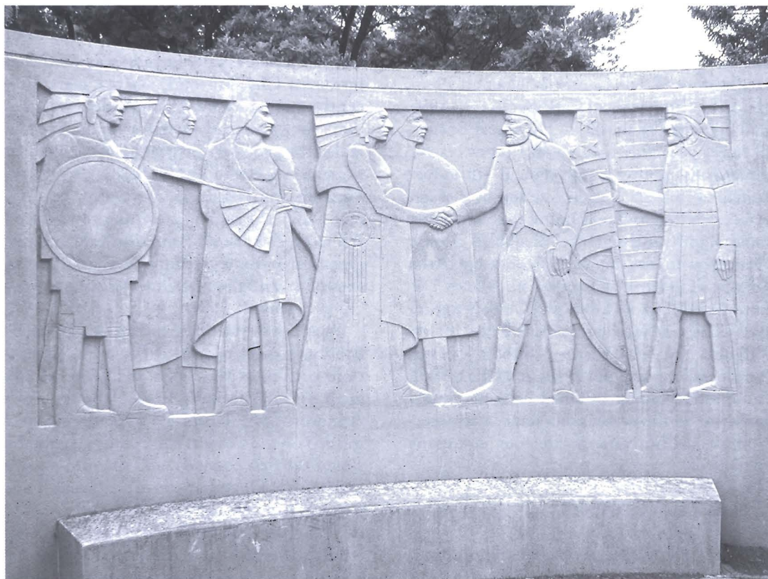
FIG. 3. Lewis and Clark Monument in Council Bluffs, Iowa. Erected in 1935 by the Colonial Dames of America, this is one of two life-sized relief panels. The other depicts Native Americans presenting the expedition with melons.

ing between famed explorers Lewis and Clark and area Native Americans," has two large relief panels depicting American Indians presenting the expedition with melons (a rare instance of interpretation showing gift-giving by the tribes) and shaking hands with the explorers, but there is no further depth to the tribal interpretation (Fig. 3). Not only are the indigenous peoples nameless, the Councils of Power representation also renders them landless in a 1990s-era NHT marker at the monument, with a map showing the expedition route in the western portion of the continent passing through lands either designated Oregon Country, Louisiana Purchase, or New Spain, but not Indian lands. The depiction of American Indian land claims as nonexistent or subservient to other powers is repeated in the