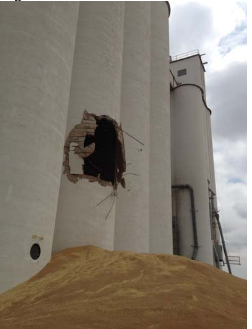
Figure 1.2: Wolf Elevator Bin Failure