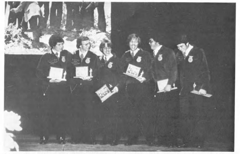
Their year is over and the 1974-75 State Officers exhibit their relief at the end of the State Convention. The plaques they are holding were presented by the Kansas FFA Alumni Association to the officers for their outstanding service to Kansas FFA.

The WEA gives FFA members an opportunity to become acquainted with students and adults in other nations. Participants live and work with host families, observing and using agricultural methods of their host country as they learn the history, culture, traditions, and life styles.