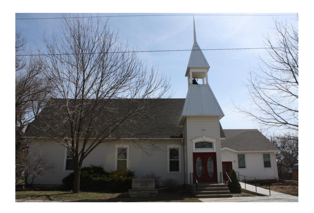
Figure 3. Photograph of present day Presbyterian church. spring 2013. The building looks very similar to the original, but has been updated.

Many parishioners have known no other parish than Idana Presbyterian. "I've been coming here for 76 years," Taylor Meek said.