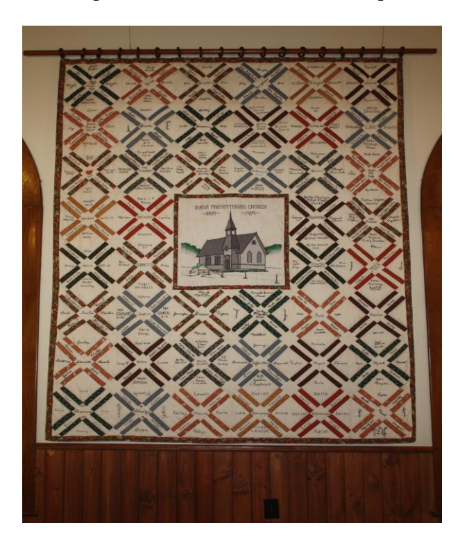
Figure 4. A photograph of the quilt the church members made. This is a 2013 picture of the commemorative quilt. Notice the small marking of each of the family names in the parish.

At the centennial, parishioners from all over the country came back to their home church to celebrate its history. Members of the parish made a commemorative quilt, as shown in Figure 2.