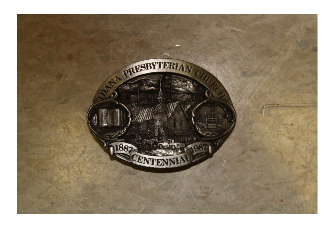
Figure 5. Photograph of the belt buckle from the church's centennial. Notice the detail and history displayed through the engraved images.

Each family member created their own block, including their family members' names.