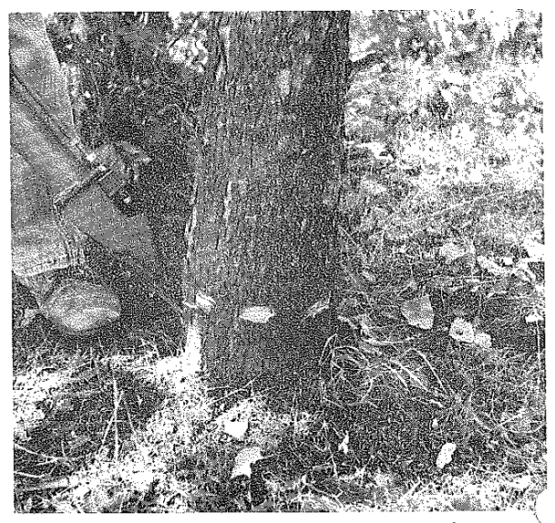
Figure 2.—We made cuts 3 inches apart close to the ground and metered 1 milliliter of herbicide into each cut.