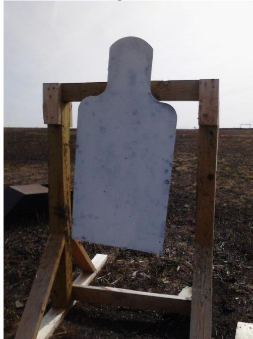
Iron Maiden (2013)

Range control personnel are responsible for the maintenance and the up keep of the ranges on Fort Riley; they are the individuals who go down range (past the firing line) to replace worn out targets, work on the pop-up machines, mow the grass, clear snow, keep the range clean, and maintain the protective berms. When the ranges are in use the range personal operate the targets from the control tower.