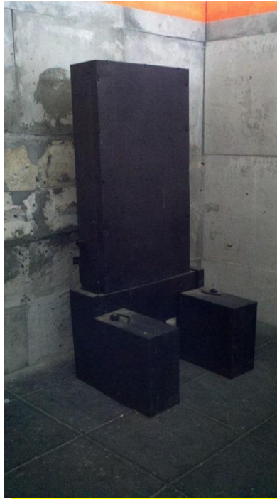
Bullet Stop (2013)

Both shoot house buildings are an open air design that allows the wind to blow freely through them; this is supposed to negate the need for a mechanical venting system. (2)