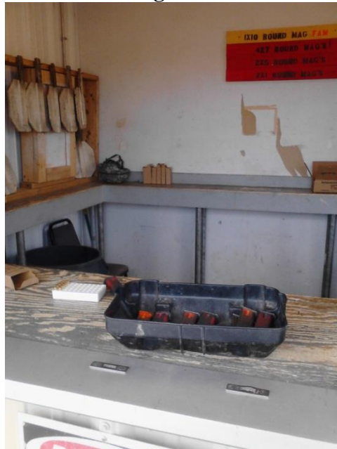
Range 2 Ammo Shed. (2013)

Testing areas down range demonstrated that as assumed there is lead contamination in these areas and personnel are exposed to it. Lead levels of 1,100 \mu g were detected on the Iron maiden at range 6. The machine responsible for raising/lowering pop-up targets on range 7 tested positive at 90 \mu g, but the pop-up target machine at range 9/10 tested negative for the presence of lead. It was expected to find high levels of lead on the iron maiden since it is struck by bullets and they do not always pass through the steel plate. As for why the pop-up target machine at range 7 tested positive for lead while range 9/10 did not, I can only speculate; range 7 had over 2 million rounds fired in 2012, while range 9/10 only had only a half million fired. The sheer difference in numbers can account for this difference or it is because range 7 has been in use for years, while range 9/10 is only a couple years old.