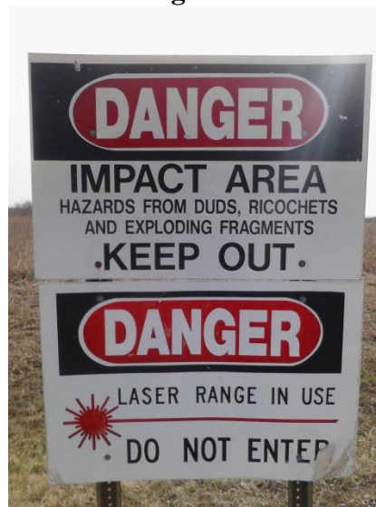
Warning Sign (2013)

Outlying the warning signs is a “hard-ball” (paved) road that encircles the impact area and outlying the hard-ball road is the “tank trail”. As the name suggests this is a gravel road that is used by tanks and other heavy military vehicles that could damage the hard-ball road. The weapons ranges for Fort Riley are on the outlying border of the impact area with all the weapons being fired towards the center. Weapon calibers such as: 9mm, 5.56, .50, and 7.62, greatly vary