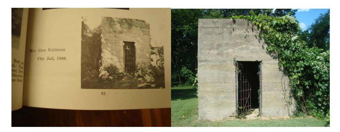
Figure 2: Hoyt city jail, 1900. Liberty Clicks in '76 . ed. Mary Willard and Doris Shoff.

building still standing in Hoyt is its jail, a one-room 12-by-11-foot building located in the middle of town that looks like it could still be used if necessary (fig. 2 and 3).