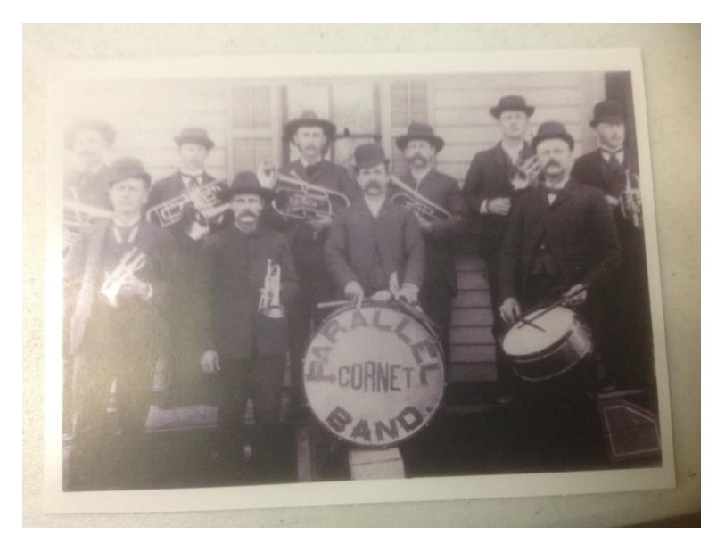
Figure 3: The Parallel Cornet Band, Circa 1890. A photo of the Parallel Cornet band. They likely played for formal events within the town or the surrounding area.

there are listed businesses in the form of a carpenter, a blacksmith, a stone mason, a general store, a dedicated hardware store, well diggers, and even a barber. An archived photo also shows that at one point, the town included a cornet band, as shown in Figure 3. However, we then see the population begin to dip. In the 1900 Polk Directory, the population of Parallel has been cut in half, from 30 to 15, the first sign that Parallel was reaching its end, only five years before its post office would close. Parallel doesn't show up in the 1912 Polk Directory at all.