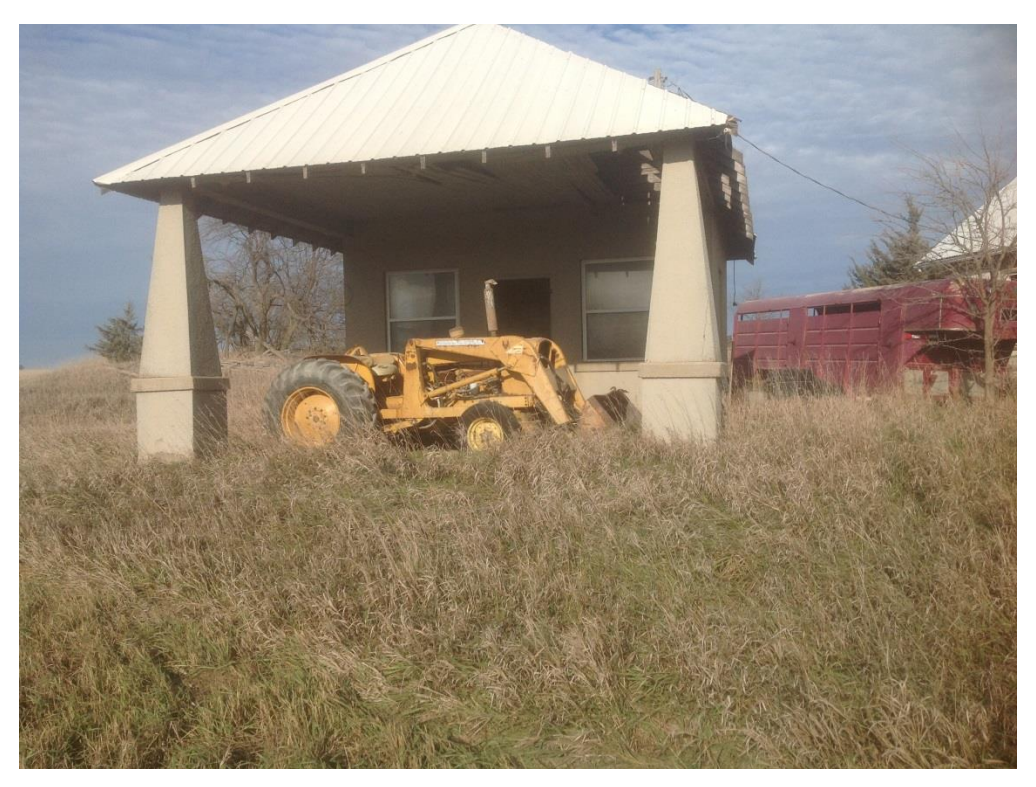
Figure 4: Parallel Filling Station

exists: the filling station on the corner of the Parallel Road and the All-American Road, shown in Figure 4 as it exists today. As the automobile began to makes its way into prominence on the farms of Kansas, a filling station would have drawn in people for the general store and could have breathed life back into the town. However, after this point, information becomes scarce and hard to find. There is a single, small entry from an unknown newspaper in the archives of the Washington County Historical society that talks about the "service station and grocery on the Parallel" being sold to new owners as the original owners wanted to return to their farm. Another small newspaper entry from Jan. 28, 1954, speaks of the store from the previous article being closed. Only a single picture of this Parallel village exists, circa 1930 or 1940, where we see the station, a single house, and a barn, as shown in Figure 5.