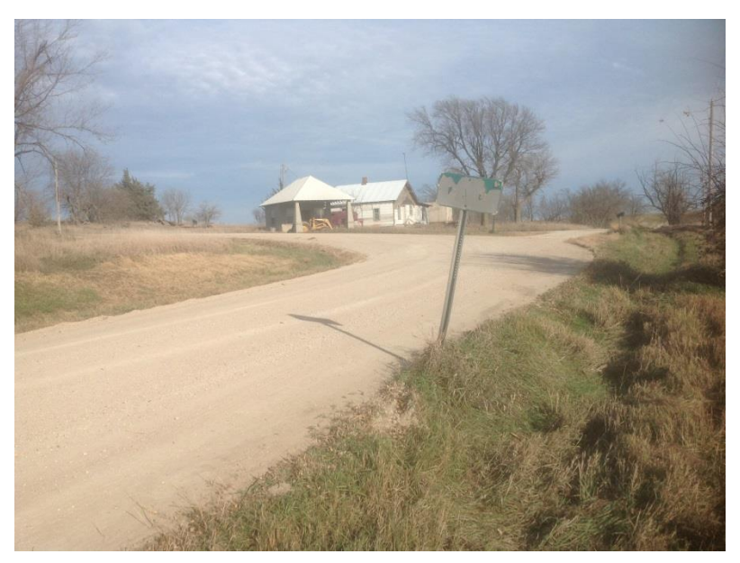
Figure 1: The town of Parallel, Kansas The town of Parallel as it exists in 2016, with the abandoned gas station, an abandoned house, and the sign at the entrance to the town.

The town of Parallel existed in Lincoln Township, Washington County, Kansas. Its unique geography included being located along the border between Washington and Riley County. The town officially existed until 1905 but continued to have residents until at least the 1950s. To create this sketch of Parallel, the author used business records, on-site photography, and research at Washington County Historical Society.