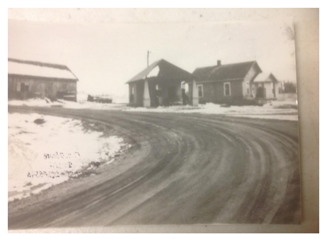
Figure 5: Town of Parallel, Circa 1930.

The lone picture of the town of Parallel, showing the filling station, a single house, and a barn likely owned by owner of both of the other buildings.