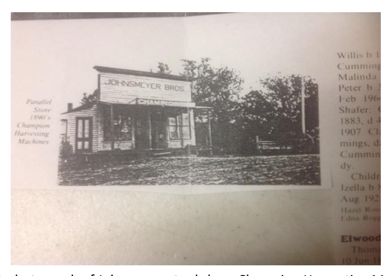
Figure 2: A photograph of Johnsmeyer tool shop, Champion Harvesting Machines, in Parallel, Kansas circa 1890. The location of the shop within the remains of the town is unknown.

The early town was known by its name along the Standard Parallel, but also by its post office, like many other small towns within the state of Kansas. This post office, rather than being a single permanent building, would move its address with each new post master while still officially being the Parallel post office. This can be seen when tracking the movements of the post office; research reveals that it regularly jumped the county line when it was still in service, starting in Washington County when it was founded in 1863, then moving to Riley in 1867, then back to Washington again, although the exact date is unknown. My source gives two different dates with 1867 on one entry<sup>5</sup> while having 1869 on another.<sup>6</sup> In 1877, the post office moved back to Riley County before finally staying in Washington from 1882 until it closed in 1905. This movement could account for the fact that Parallel will appear in Mayday Township on some