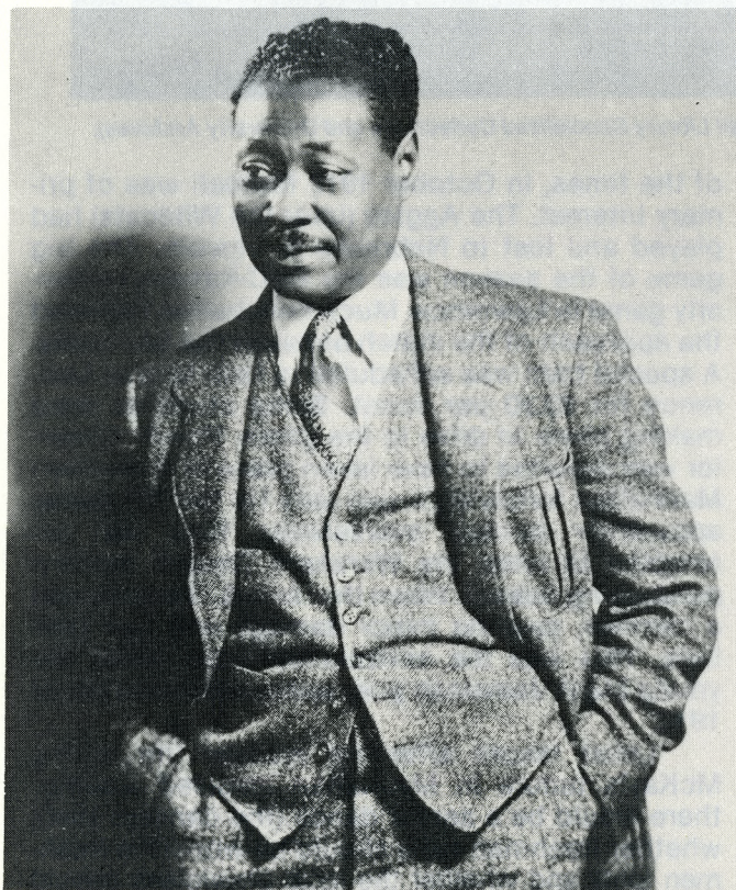
Claude McKay (c. 1920).