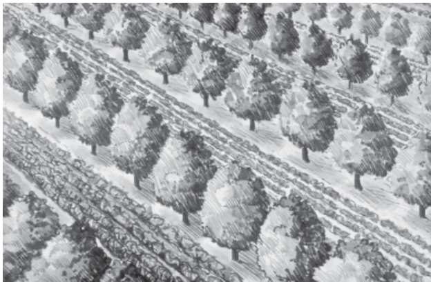
Figure 1. Schematic of alley cropping.