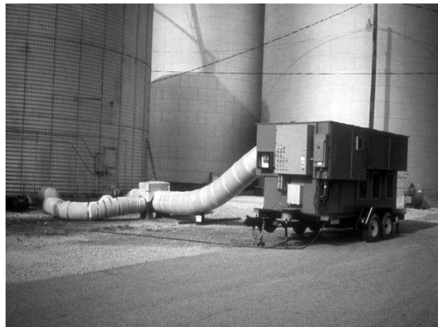
Figure 1. Grain chillers (from Burks et al. 2000).

Chilled aeration (Figure 1) is the most expensive cooling method, but it allows chilling regardless of outside air temperature. It is used commercially in 50 countries to cool about 80 million tonnes of grain annually (Maier and Navarro 2002). Grain is chilled to protect it from mold, insects, and to maintain germination. Chilled grain can be safely stored at higher moisture contents than warm grain. It takes six times more energy to reduce moisture content by 6% than to cool grain from 25 to 5°C. Air is dried and cooled before it is pushed through the grain bulk. Depending on the grain bulk and chilling unit, it takes 2 to 21 days to bring the grain temperature down to 15 to 20°C, and a second chilling may be required after 2 to 6 months. It takes about 5 kilowatt hours per tonne (kwh/t) to cool grain from about 30 to 15°C. The costs in the United States were estimated to be $1.50/t compared to $2.90/t for fumigation and aeration (Rulon et al. 1999).