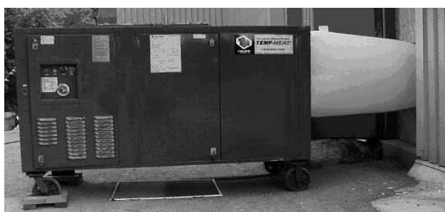
Figure 3. Propane-fired heater (Temp-Air) heater (source of heat for studies in Figure 2). The door is sealed with plywood, and a flexible fabric duct delivers heated air through a hole cut in the plywood.

heat treatment, and the entire air within the building is exchanged four to six times per hour. The number of air exchanges when using electric and steam heaters may be one or two per hour. The forced air also allows heat to reach gaps in the building and equipment much better than electric or steam heaters. Forced-air gas heaters can use natural gas or propane as fuel. They have air intakes outside the heated envelop, and nylon ducts are placed within the facility to introduce heated air. Because hot air has a tendency to stratify horizontally and vertically within a facility, several fans should be placed on different floors to redistribute heat uniformly. Fans should be directed to areas that are difficult to treat such as corners, along walls, dead-end spaces, and areas away from the heat source. During heat treatments, fans should be moved to eliminate cool spots (less than 50°C). In addition to food-processing facilities, heat treatment can be used in empty storage structures (bins, silos), warehouses, feed mills, and bakeries.