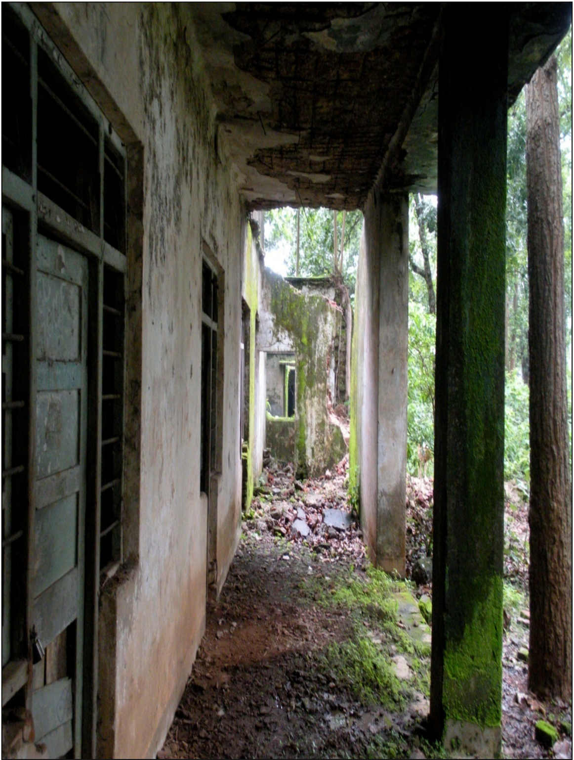
Photograph 3. Typical school building and classrooms of a tribal dominated school