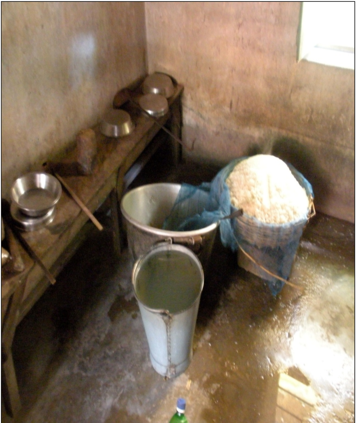
Photograph 6. Mid-Day Meal: A demonstration that hygiene and free food does not come together