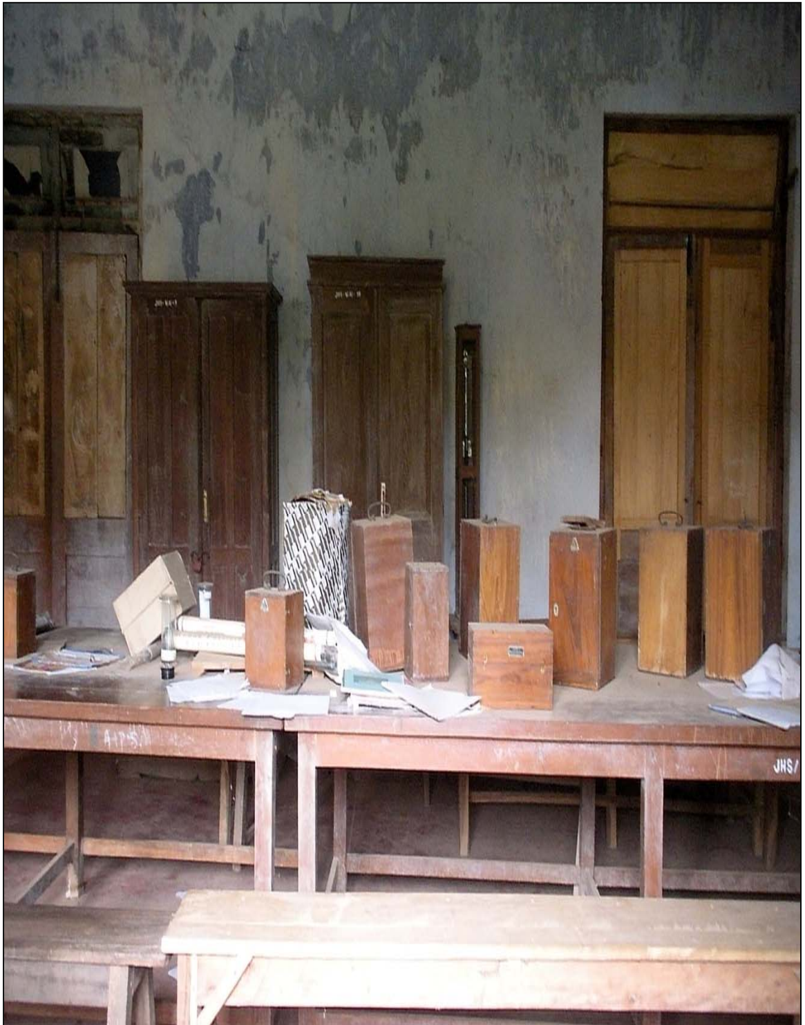
Photograph 4. An (ill-equipped) science laboratory in a tribal school