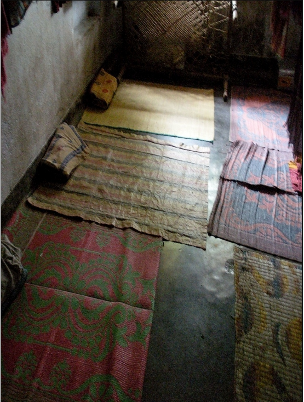
Photograph 5. A typical hostel room in a tribal residential school