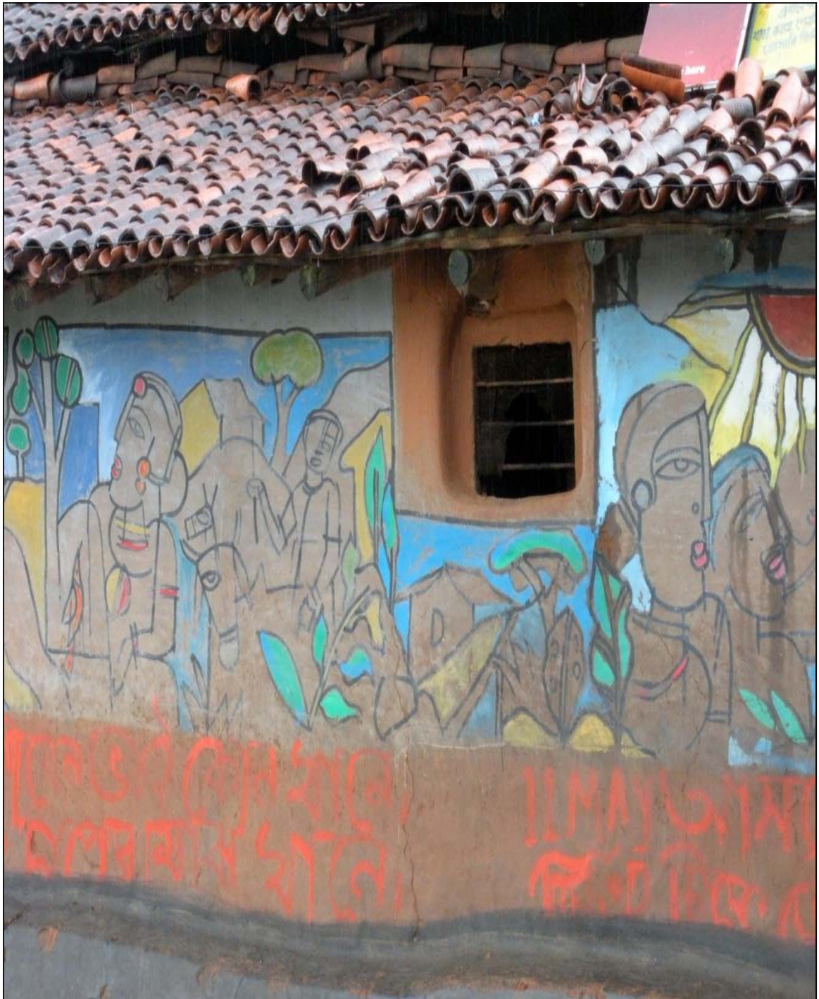
Photograph 1. Exquisite paintings on the mud walls of a tribal hut in Bagmundi