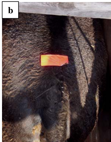
Figure 1. Estru$ Alert ® Patch at Application (a) and AI (b; device score 4).