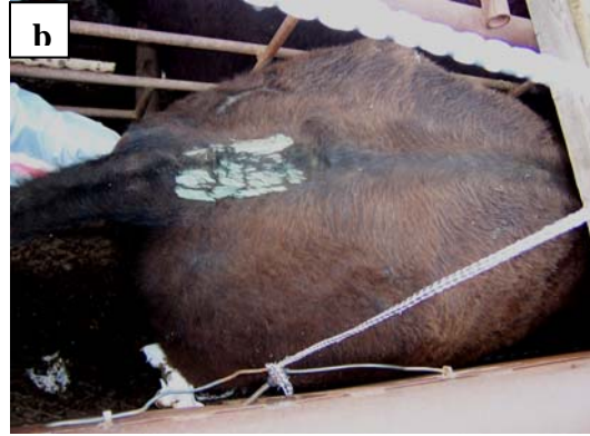
Figure 2. FiL ® Tailpaint at Time of Application (a) and at AI (b; device score 1).