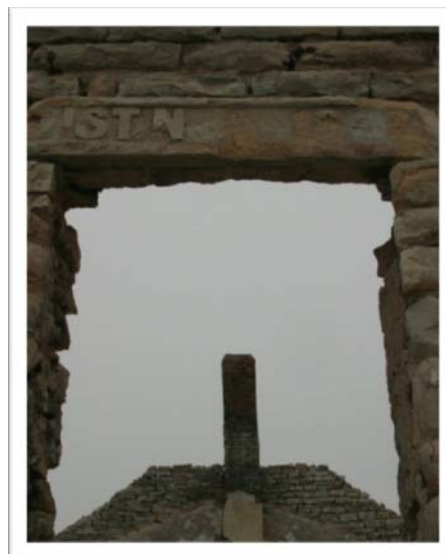
Figure 1. Entry Way to Bean School. This sign above the door of the school reads Dist. No 3, the proper name of the school.

During the period that would become known as the Kansas Exodus, many African-American families migrated from the Jim Crow South into northern states. Though Kansas offered refuge for these oppressed people, the state had its own race issues. Kansas Legislature in 1879, some 17 years before Plessy v. Ferguson , ruled that cities of more than 15,000 residents must have segregated elementary schools. Within this segregated whole view of Kansas there were a number of schools that were integrated throughout all of this. The smaller population of Alma Township did not lend itself to a segregated education and therefore their schools were integrated. Alma also boasted one of the largest African-American populations in Wabaunsee County. 1 The Bean School, also called District School #3 (which was engraved above the door and portrayed in Figure 1), was located just outside of Alma and offered an integrated education from 1893 until 1942. 2