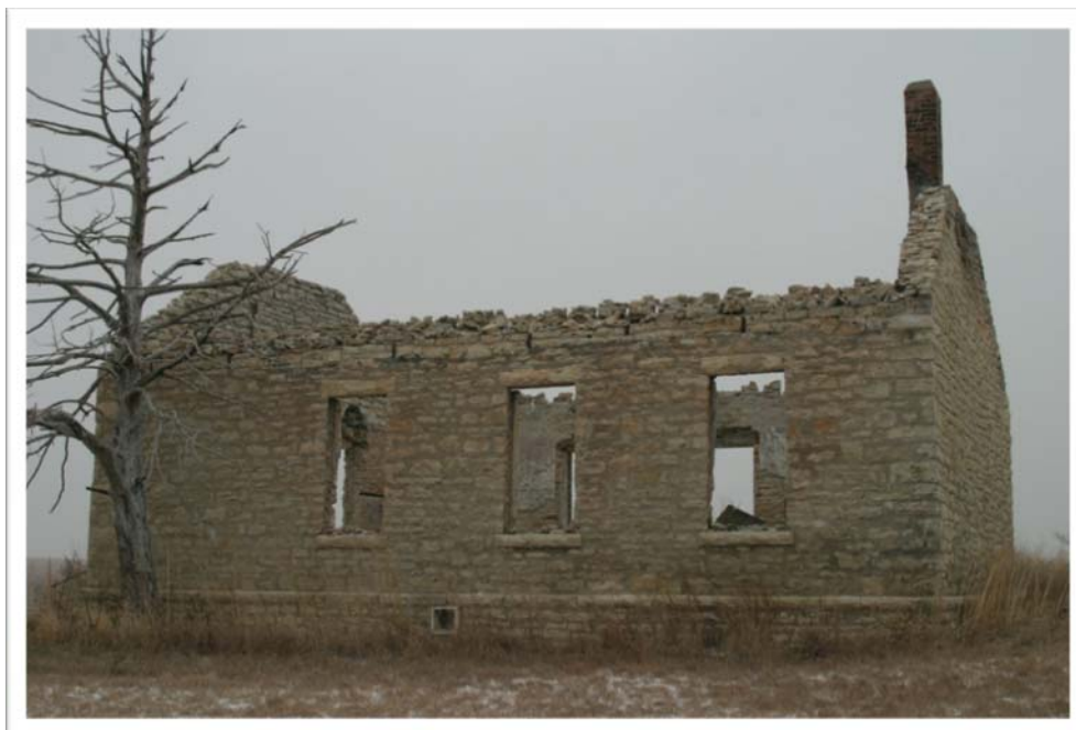
Figure 3. Ruins of the Former Bean School. Alma, KS. After a recent fire, only the stone outer walls of the school remain.