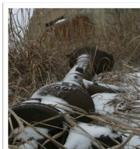
Figure 4. Remnants of Bean School's Well. This pump was used to fetch the water during the schools operation.

Curriculum for these early schools was focused around reading, writing and arithmetic. The textbooks used were generally whatever the local community could