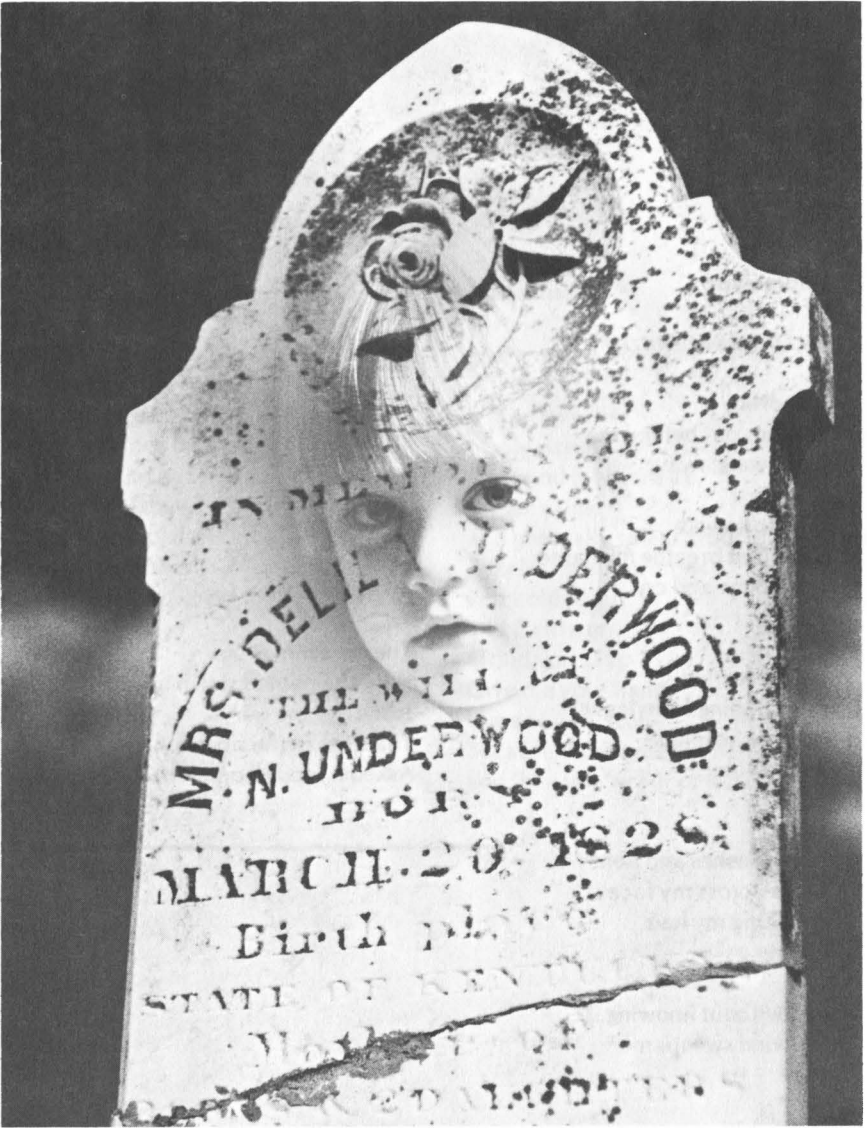
by Randall Shuck