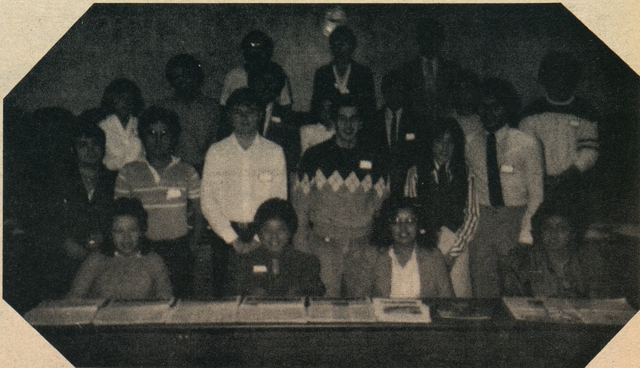
Representatives of MEChA organizations from Hutchinson Junior College, Wichita State University and Garden City Junior College met with the KSU MEChA organization at KSU in October to coordinate activities.