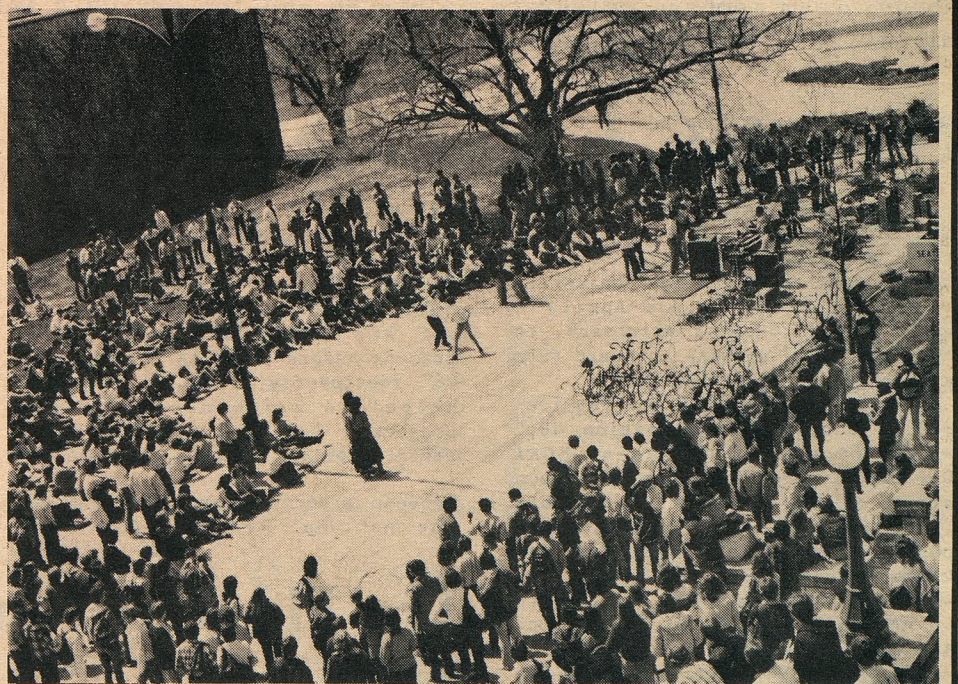
How do you attract a crowd at K-State? Plan music for a sunny day! "Grupo Caribe" play island music during Festival HispanoAmericano, lower photo. Members of the Ballet Folklorico Paso Del Norte, from El Paso, perform in the Union, above.