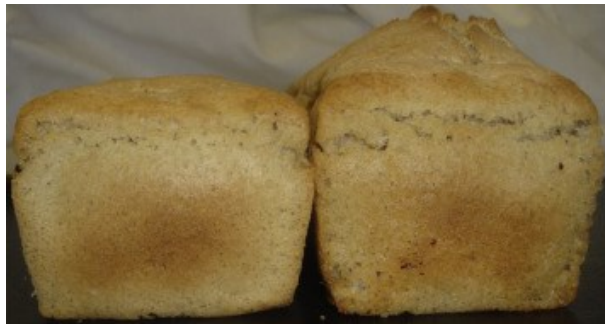
Figure 2. Breads produced from untreated and heat treated sorghum flour. (27).