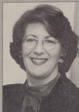
FCC Commissioner Susan Ness