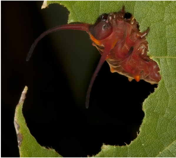
Figure 1. A pipevine-swallowtail caterpillar ( Battus philenor ) feeds on a host plant ( Aristolochia spp.). Interactions between insect herbivores and their host plants at the community level can have nonrandom structural properties which vary across environmental gradients.

(Bascompte 2010), or they predict likely changes in community persistence when components are removed (Pocock et al. 2012). The ecological network approach emphasizes species interactions and internal architecture of linkages in communities as important factors affecting species persistence across changing environmental conditions (Pearson and Dawson 2003). The approach benefits from methodological contributions across many disciplines, including physics and sociology (Bascompte 2009).