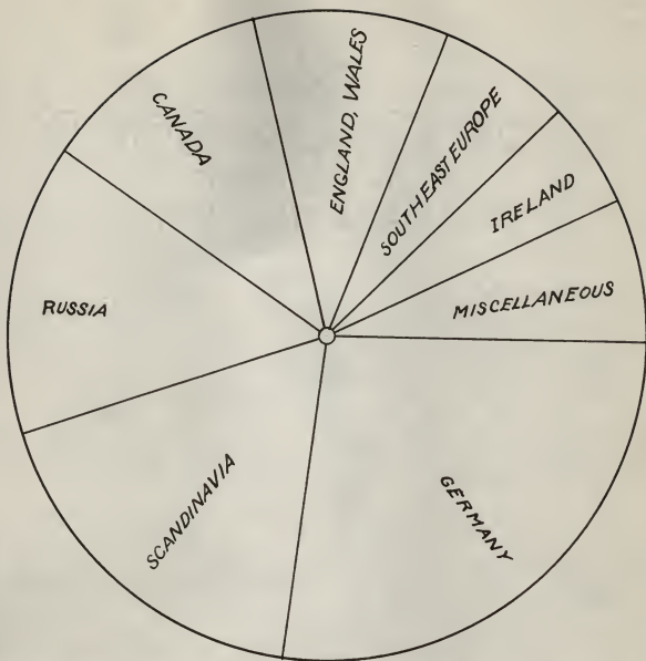
Fig. 2. The proportion of total foreign born population in Kansas in 1885 who came directly from country of origin. 28