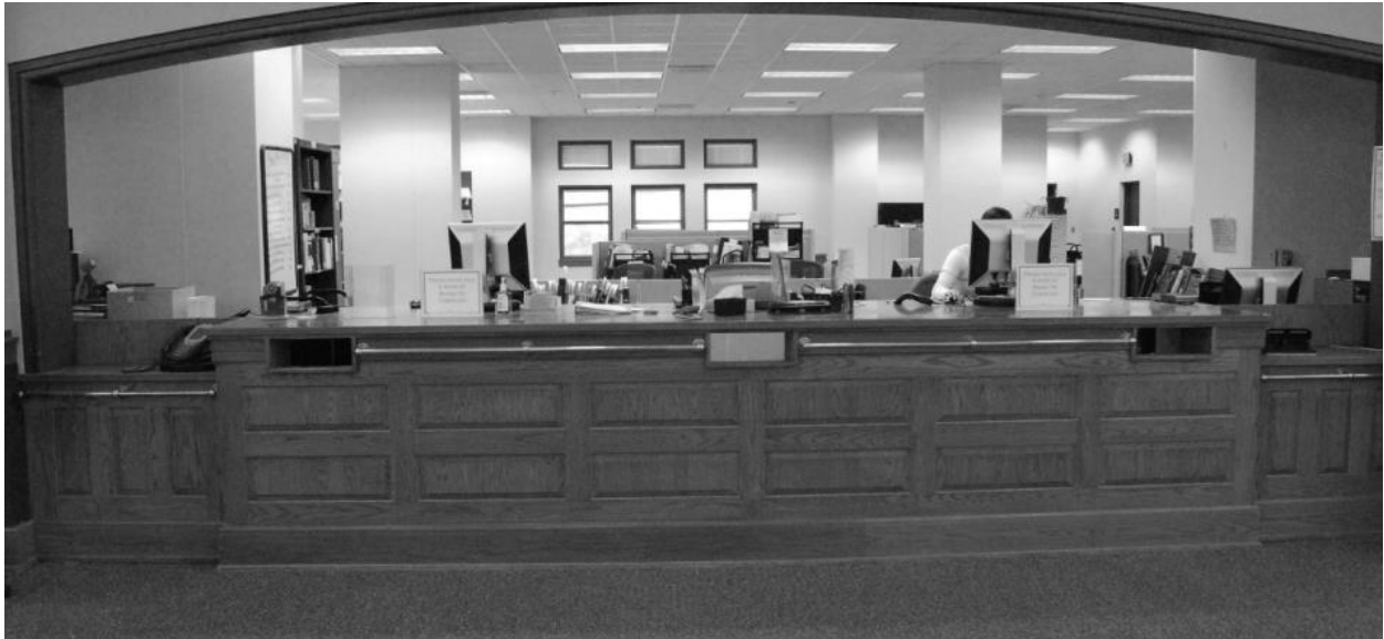
Hale Library's Consolidated Help Desk (May 2009 – Aug. 2010)