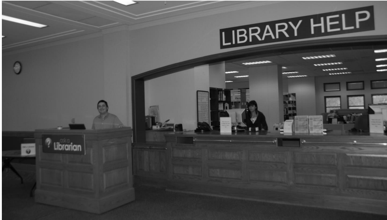
Hale Library's Partially Unconsolidated Help Desk (Aug. 2010 – present)