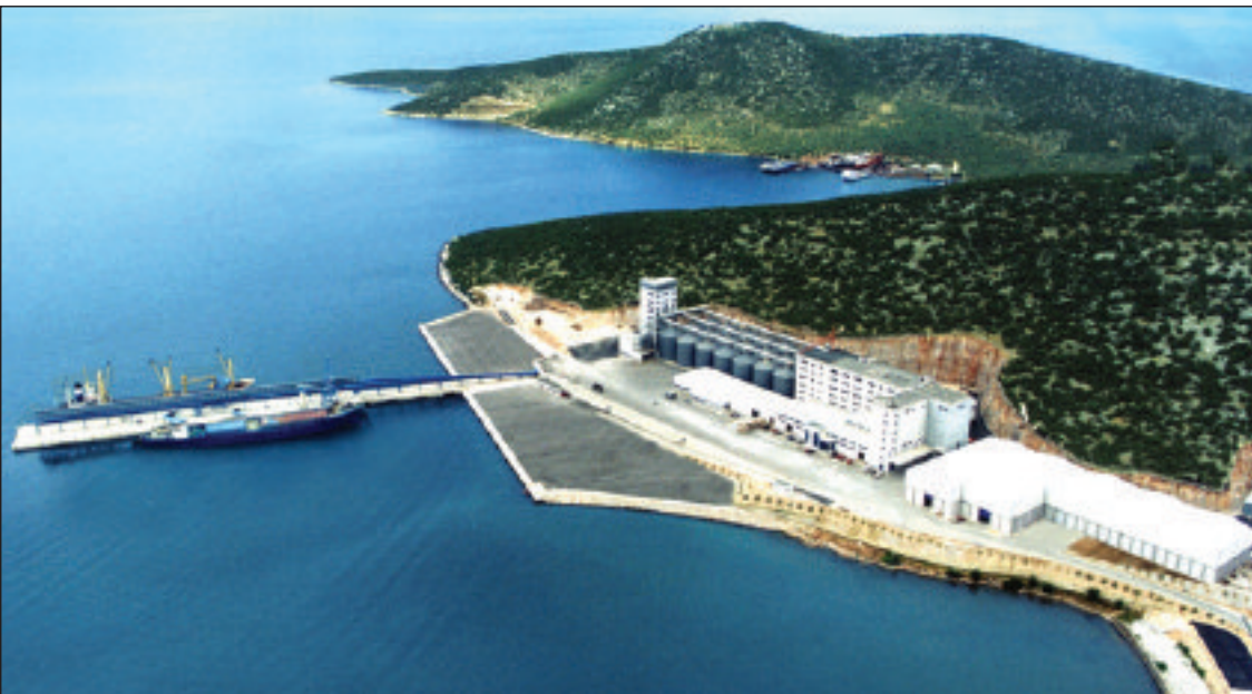
Aerial view of the Loulis Mill located in the picturesque area of Sourpi, Greece.

to use science-based approaches to help flour mills in Greece solve pest problems.